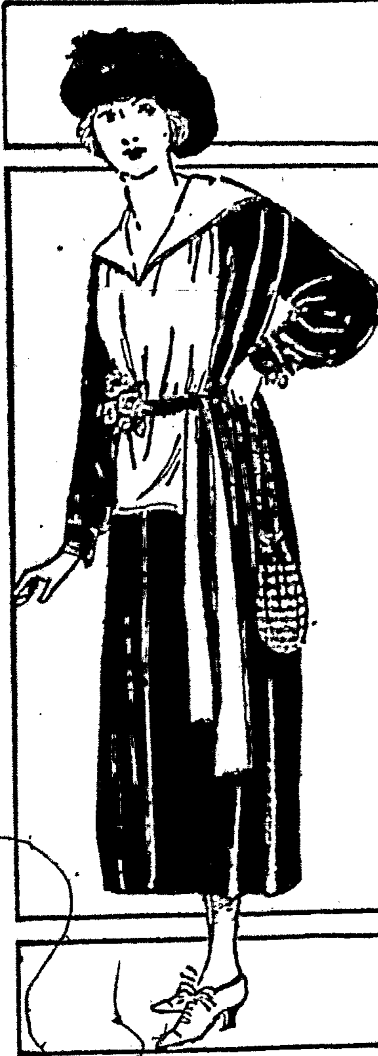
This sketch for which the French woman willingly posed, shows a mid-summer frock of pale gray Chinese crepe de chine, with its tunic coat pushed far back toward the sides to show a sailor blouse of white crepe de chine, with its collar edged with French-blue velvet to match the "Blue Devil" cap on the head.

"Once upon a time," said this woman, "this costume was considered the uniform of the American summer girl."