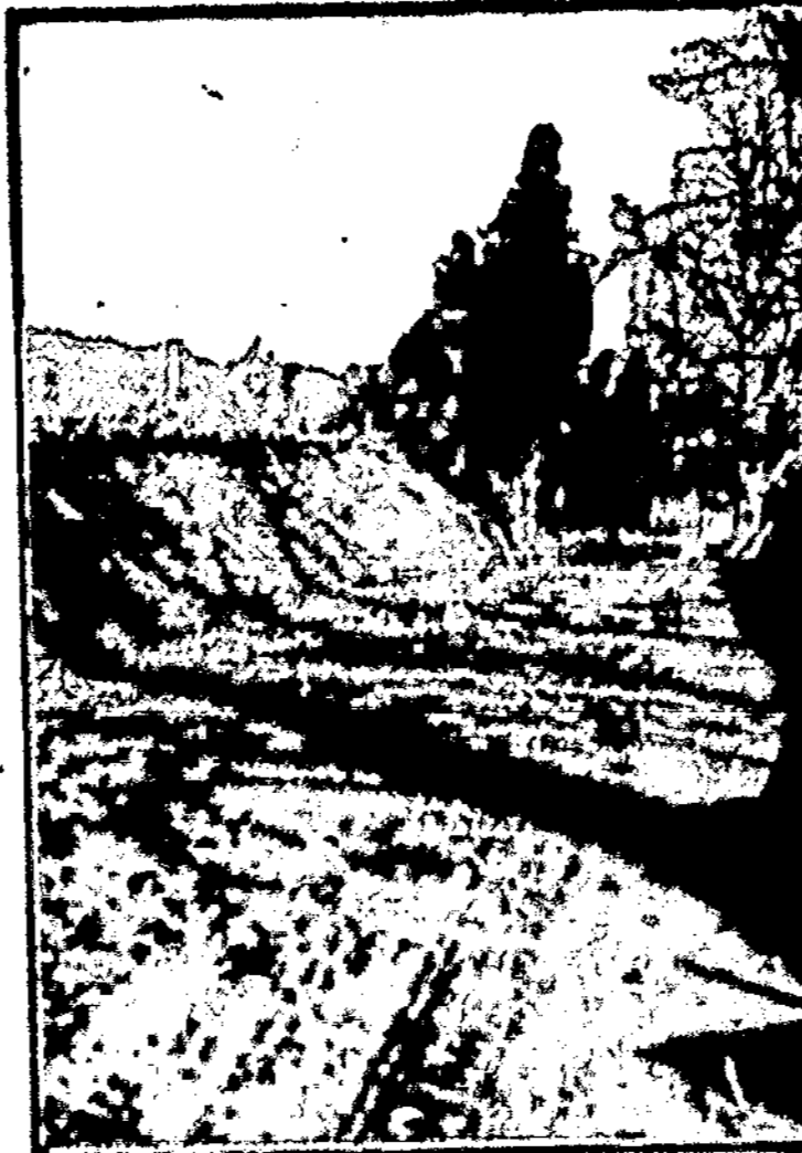
Good Road in Southwest.

It would be a difficult matter to estimate the advantages of state and interstate highways. Public highways are now being located and built in most states of the Southwest and the interest these have contributed to good roads is of immense benefit to local communities, counties and states. The highways, it is understood, will connect states, counties in states and form a