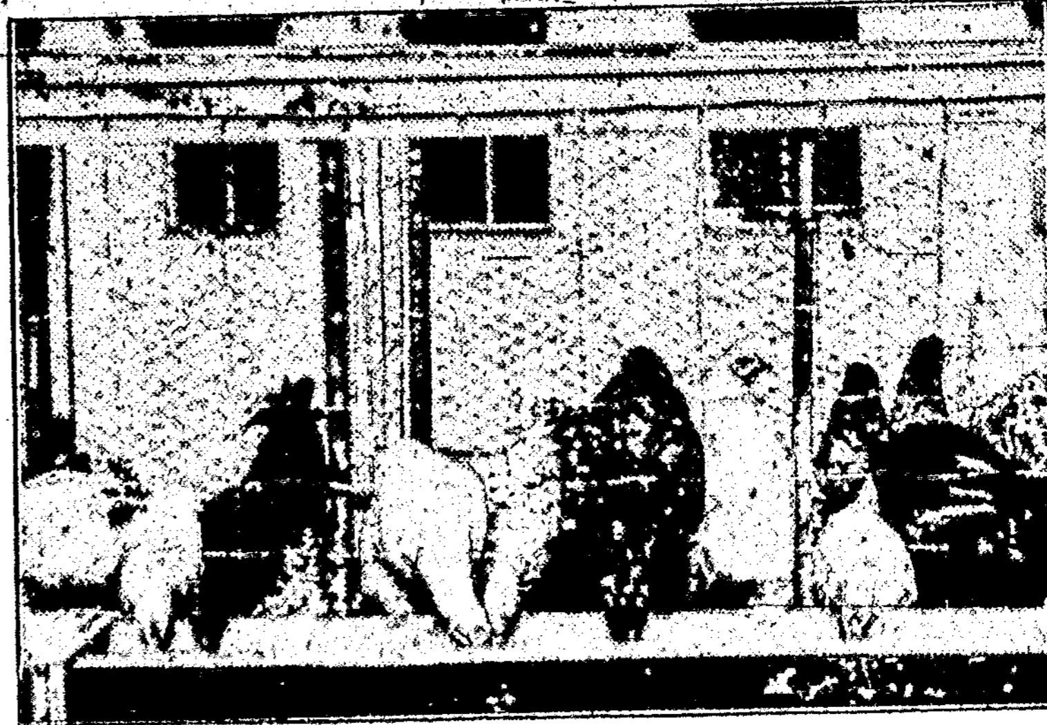
Chickens Being Fattened in a Home-Made Coop. They Just Eat, Take No Exercise, and Grow Fat.