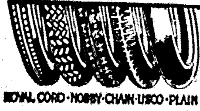
ROYAL CORD - NOBBY CHAIN - USCO - PLAIN

Select your tires according to the roads they have to travel: In sandy or hilly country, wherever the going is apt to be heavy—The U. S. Nobby. For ordinary country roads—The U. S. Chain or Usco. For frost wheels—The U. S. Plain. For best results—everywhere—U. S. Royal Cords.