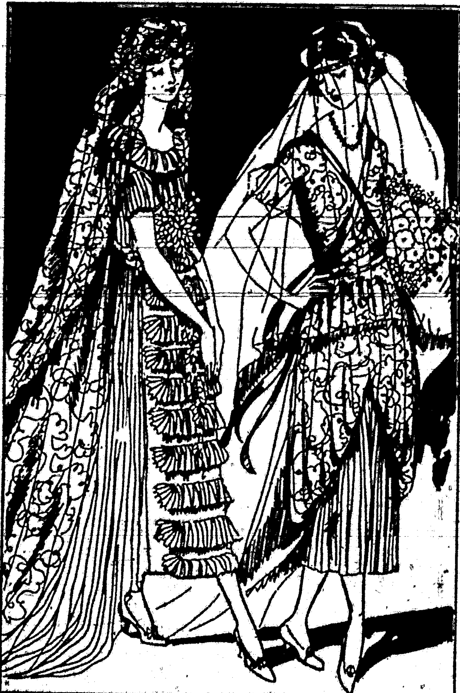
Bride's dress of accordion platted silk tulle having an apron panel front made of a succession of narrow platts ending in sun-ray rosettes. With it is worn a real lace veil held in place by a diadem of orange blossoms mounted on a frame of silver filigree. Also a lace bridal dress of oriental form made over a foundation of platted tulle. Silver ribbon straps the figure in Egyptian mummy style. The shower veil of tulle is encircled by a diamond and platinum fillet.

an Egyptian design. The foundation at it is of platted tulle. Over it the lace tulle is arranged in a low drapery. The skirt, as well as the bodice fullness, falls in puff and blousing draperies. Strapping the figure in typically Egyptian mummy style are bands of silver ribbon which cross the shoulders and pass to each side of the figure, falling in pendant loops and ends at either side. The décolletage is Y-shape and only slightly low. Little puffs of tulle form the sleeves. The veil is a shower of tulle held in place by a diamond and platinum fillet. Vivid-Toned Taffeta for Bridesmaid. Decidedly different in type are the bridesmaid's dresses of vivid-toned taffetas which often have an all-over pattern of embroidery in open eyelet or broderie anglaise fashion. Such frocks are perfectly simple, with nothing more than an increased garland of roses and buds on each side of the little full skirt. Each attendant wears a different color; the favorite shades of spring being orchids pink, jonquil yellow, elegant rose and stem green. Distinctly bridey are the new robes d'intérieures, without which no modern trousseau is complete. In fact, more emphasis is put on this sort of trousseau garment than on any other. A new Greek type of indoor dress, charming in its youthfulness and simplicity, has just been completed by a fashionable dressmaker for the trousseau of a June bride. It is developed in soft satin with a platted chiffon under petticoat, and delicate borders