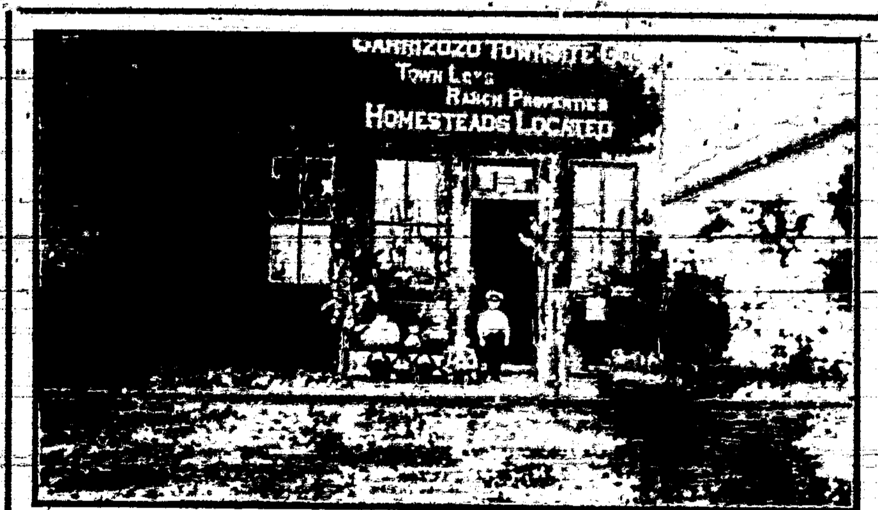
A sample of Vegetables and Grain, grown in the Carrizozo Valley without irrigation, on sod ground plowed up last year for the first time

The town of Carrizozo has grown up from the Plain, where, a little over a year ago there was nothing but a depot and water tank. There is a reason for this wonderful growth, and the same natural conditions which caused it will lead to a development within the next five years which has no equal in the history of the west.