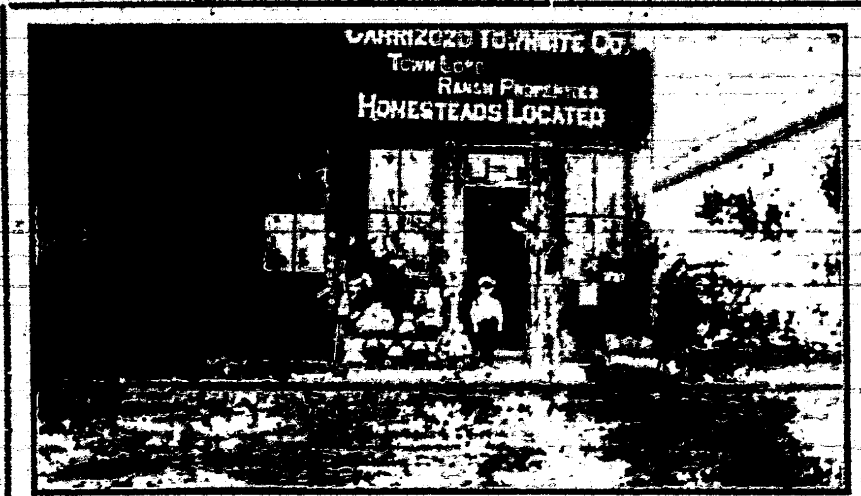
A sample of Vegetables and Grain grown in the Carrizozo Valley without irrigation, on sod ground plowed up last year for the first time

There is a reason for this wonderful growth, and the same natural conditions which caused it will lead to a development within the next five years which has no equal in the history of the west.