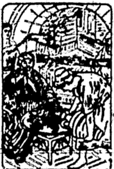
The Rich Man's Table

Now we see that our lesson is a parable (Matthew 13:34). To take it literally involves the absurdity of supposing that all beggars go to Heaven and all wealthy to Hell; for the parable says nothing about character. But in a parable the thing said is not the thing meant. Thus wheat and sheep represent children of God, tares and goats represent those dominated by the Adversary.