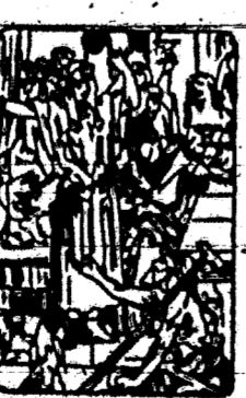
Lazarus at the Gate.

The Poor Man of the Parable. Lazarus represented an outcast class—publicans and sinners, who had alienated themselves from God's favor; and Gentiles, to whom favor had never been extended. (Ephesians 2:12.) These had no fine linen of typical justification, no purple of Kingdom prospects, no rich promises. All that they could have were crumbs from the rich man's table.