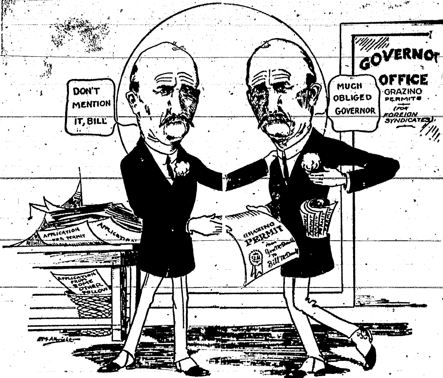
OR THE STATE LAND TWINS

ed with him. But it didn't phase the "hard headed Scotch business man" from Lincoln county. He knew the kind of men he wanted in his administration, and he got them.