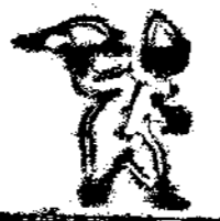
Table Supplied With Best The Market Affords

Best of Accommodations To All the People, All The Time.