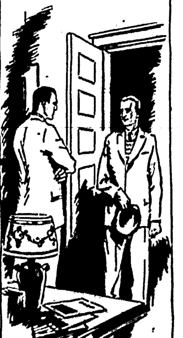
"What Are You? The Gardener?"