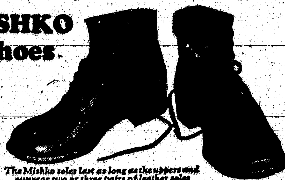
The Mishko sole last as long as the uppers and outwear two or three pairs of leather soles