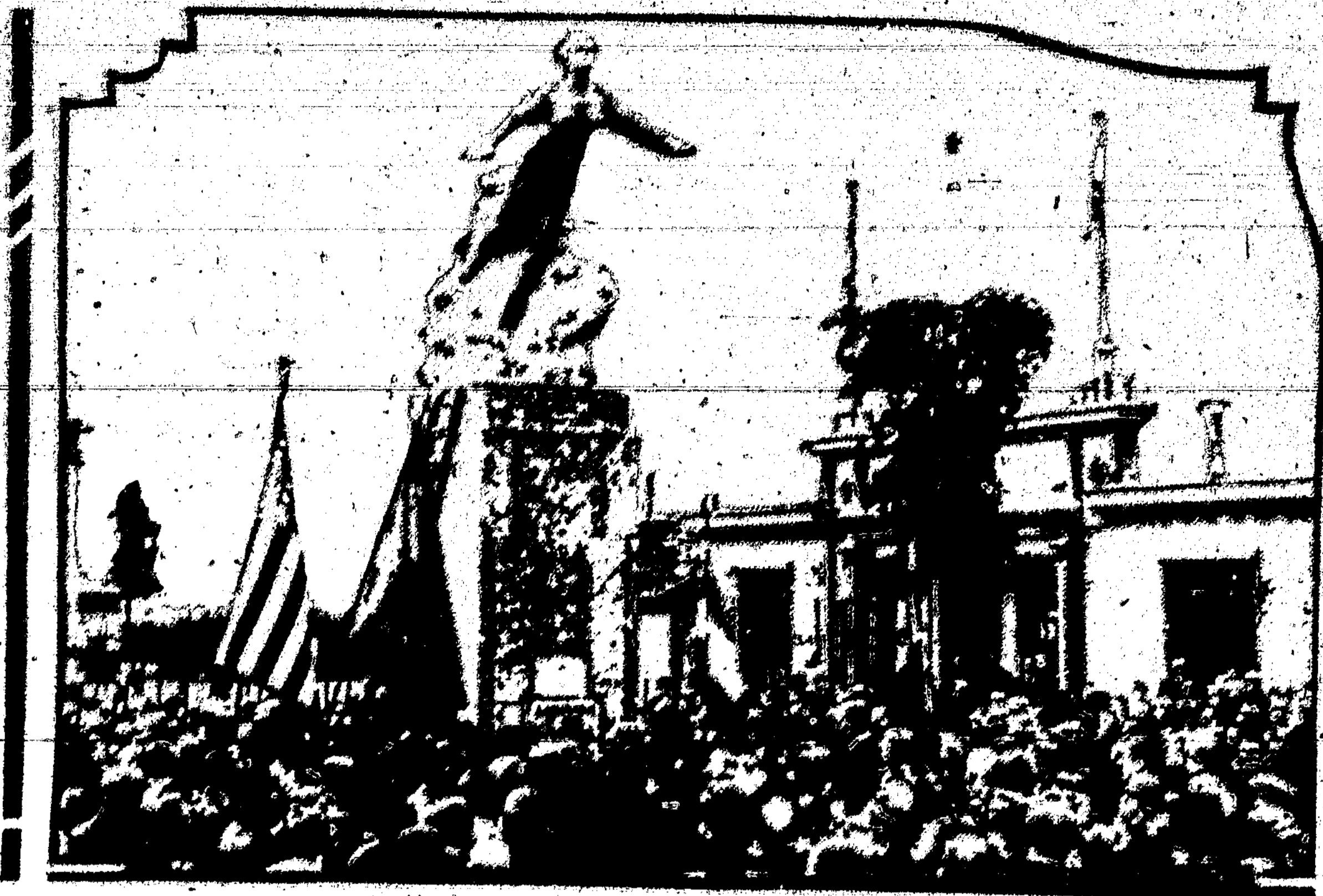
The beautiful monument at Le Bourget field, near Paris, just after it was unveiled recently with impressive ceremonies, attended by high French government officials and the American ambassador, Myron T. Herrick. The monument was dedicated to the lost French flyers, Nungesser and Coli, and to Colonel Lindbergh.