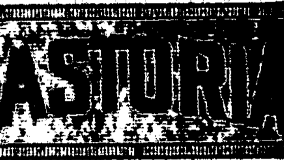
W. N. U., DENVER, NO. 46-1930.