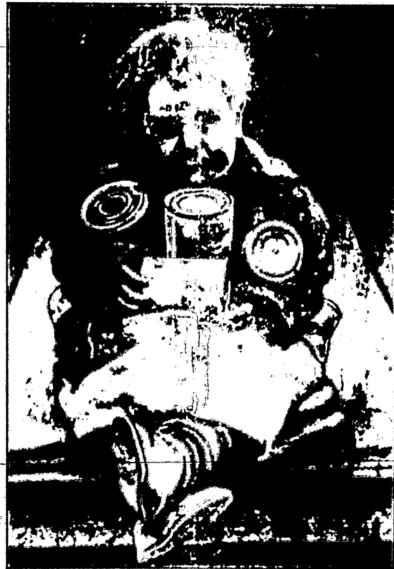
This baby in a drought stricken section of West Virginia was one of the ultimate consumers of the foodstuffs given by the American Red Cross in the past year. More than 2,750,000 persons were fed by the organization.