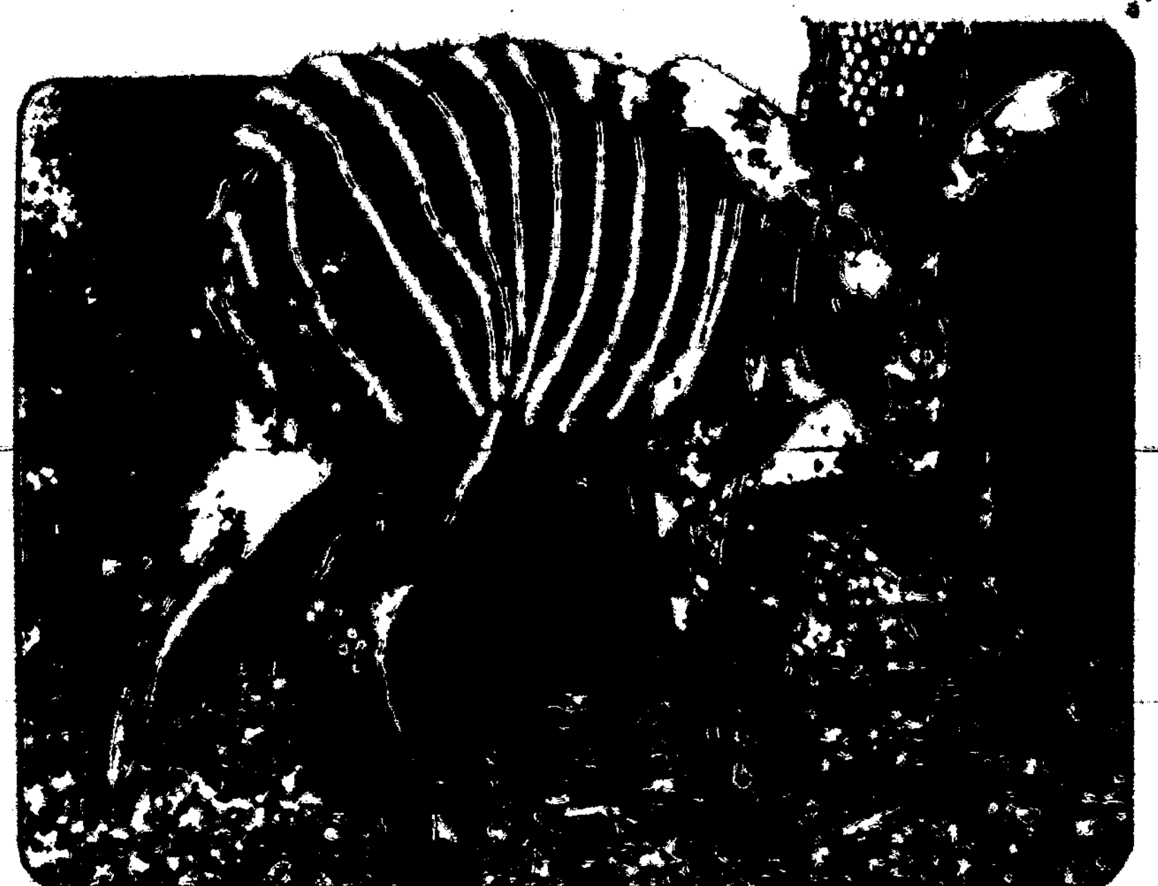
This bongo antelope, a rare species from Mombasa, British East Africa, arrived on the steamer American Banker and was transported to its new home in the Bronx zoo, New York. The only one of its kind in captivity, the bongo antelope is a timid creature which rarely ventures from the forest deeps in the Aberdare mountains in East Africa.