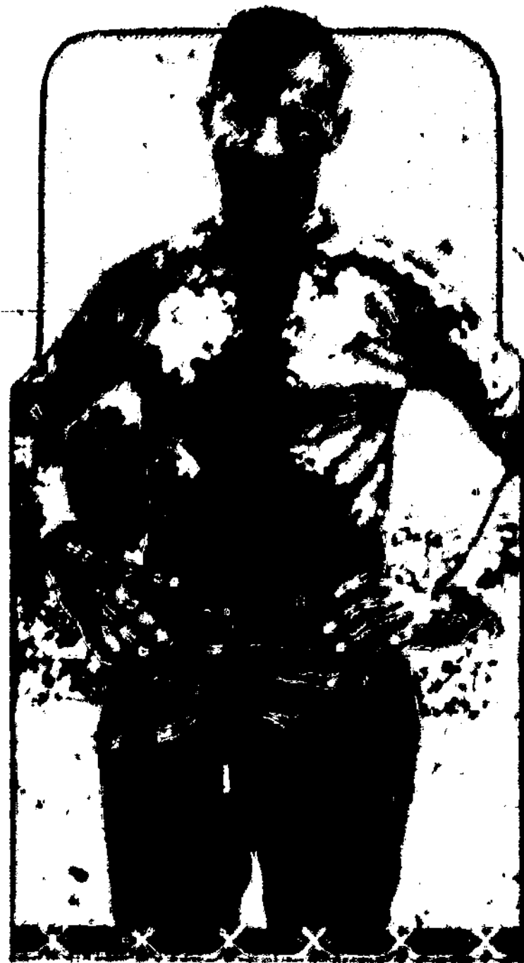
Clark D. Shaughnessy, who succeeds A. A. Stagg as the football coach of the University of Chicago, comes direct from Loyola of New Orleans where he has been coach since 1927. Before that he was coach at Tulane university where he made an excellent record. Shaughnessy graduated from the University of Minnesota, on whose teams he played in 1911, 1912 and 1913.