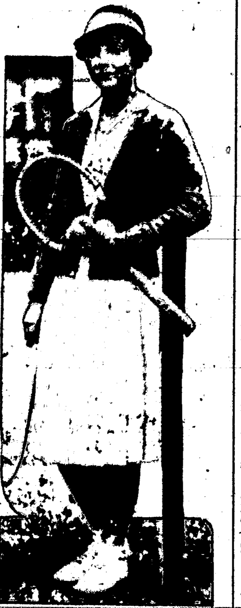
Helen Willis Moody, former American women's tennis champion, who was forced to retire from the game a year ago because of back trouble, is practicing in California and may attempt a comeback.

than wasted horse power. A person who would have friends must show himself friendly. The light that shines from your personality makes your world. If you radiate sunshine and joy you will discover the same in other people. If you are selfish and mean you will find the same reflected back to you. We always see in the other person the fault that lies deepest in our own personality. This law, which seems like a paradox, also affects the lives of other people. Emerson said, "A great institution is but the lengthened shadow of a single man." True—not only of institutions but of individuals. Henry Ward Beecher bought a newspaper from a poorly clad boy on a day in midwinter. He remarked, "Poor little fellow, aren't you cold?" The boy replied with a smile: "I was, sir, before you passed." It is said that Phillips Brooks could change the mood of a passing crowd on a rainy day in Boston because of his contagious and fascinating smile. We are told that "it takes sixty-four muscles of the face to frown and only fourteen to smile." Even nature has made it easier for us to have joy in our faces rather than hatred or anger. Browning makes Pippa say, "Wherefore reprove—with thee to lead me—O day of mine." Let Your Light Shine! Western Newspaper Union Bears Catch Salmon Bears in Alaska are expert at catching salmon.