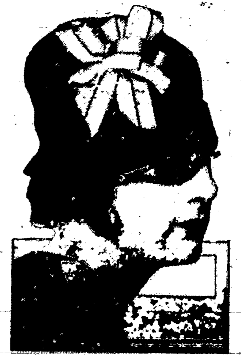
Fine brown straw trimmed with white, green and brown striped ribbon, modeled by Roxane.