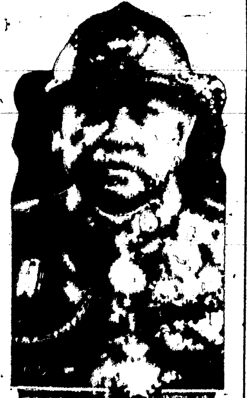
Col. Phya Bhalol who now rules as dictator of Siam following the abdication of King Prajadhibodhi. Sharing his power with a national assembly, he commands the army and navy and has the armed forces to support his government.