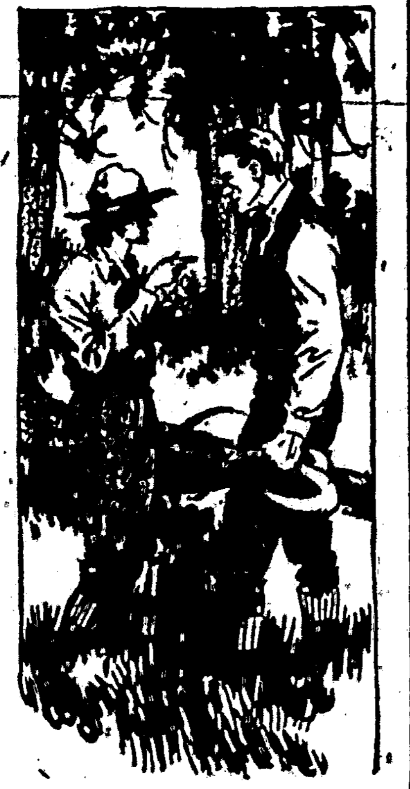
The Man Looked Down in Amazement.

They were in Jack's cabin; Hammond was still shaken from the excitement caused by the panful of earth which he had taken from the gravel of the bench-land test pit. Kay walked about nervously. Kenning pawed through a tin box which he had brought down from his cabin; Hammond likewise had taken a bundle of papers from its hiding place under his bunk. "It's a damn good thing we didn't take care of that English syndicate before we sank that test pit," Kenning said. "Well," Kay announced, "if you had, I'd have been sunk." "You?" "After all the touting I did, to get Jack to take your advice." "That would have been a hot one, now wouldn't it?" Jack Hammond hardly realized that he was speaking. He still could remember little but that pan of gravel as re-