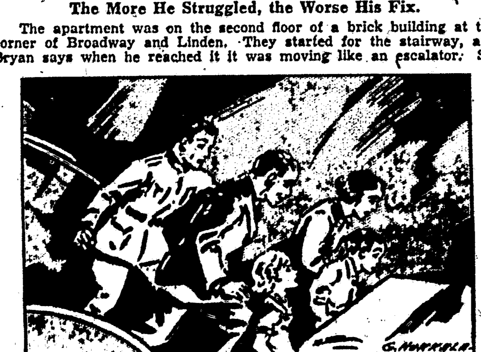
The stairway was moving like an escalator.