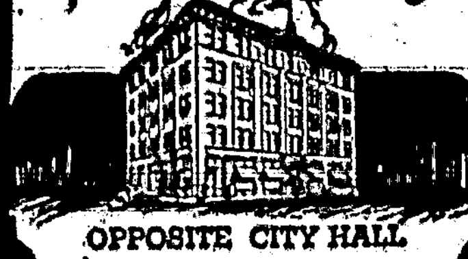
OPPOSITE CITY HALL