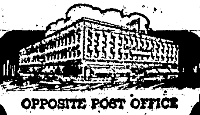
OPPOSITE POST OFFICE