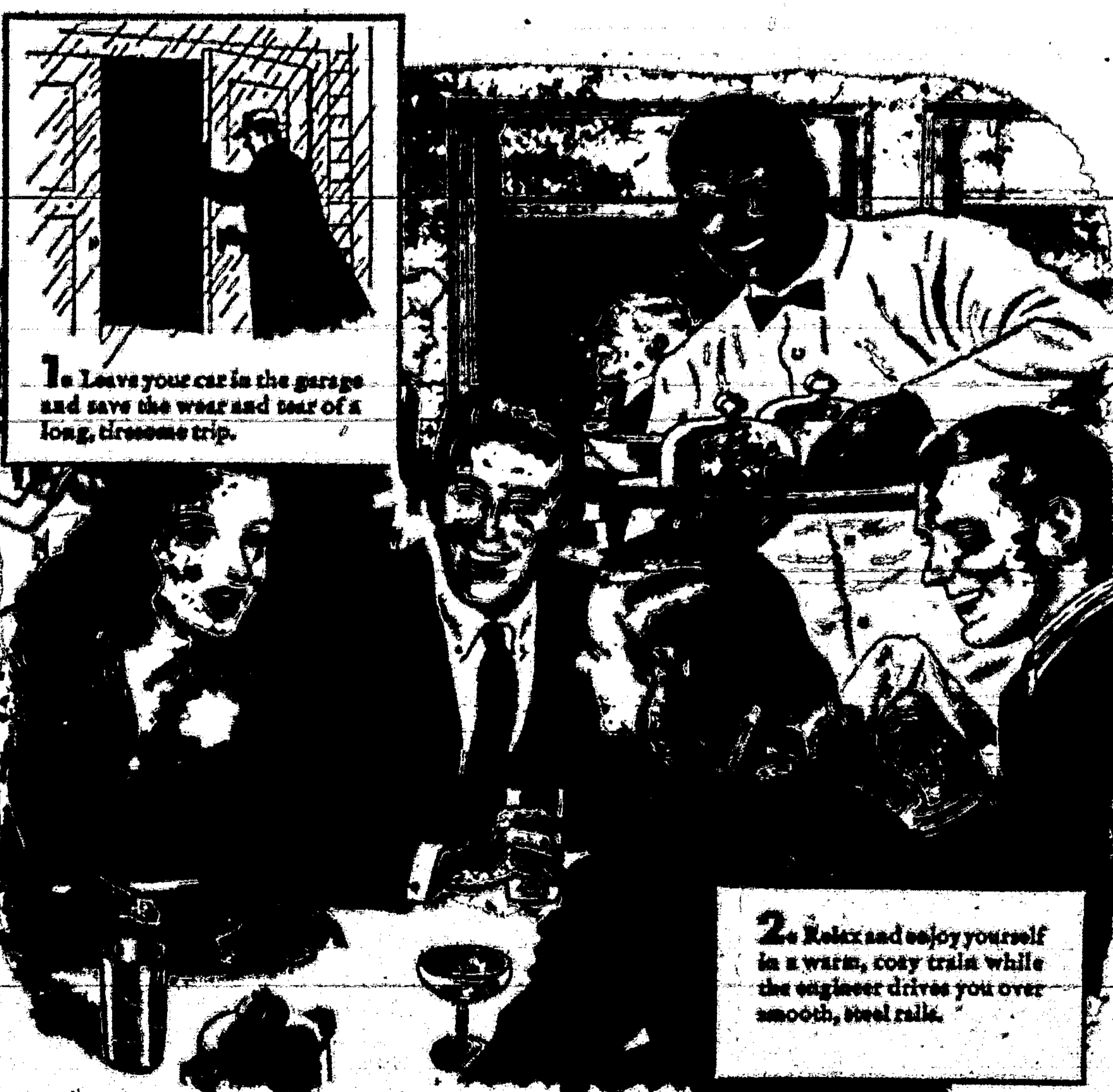
1. Leave your car in the garage and save the wear and tear of a long, dreary trip.