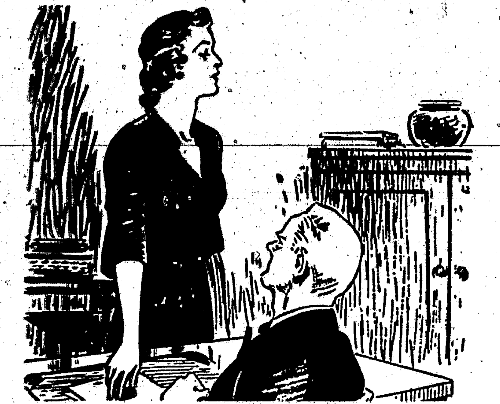
Joan laid the dazzling emerald before Karl without speaking and Karl put it in his pocket as if it had been a slip of paper.