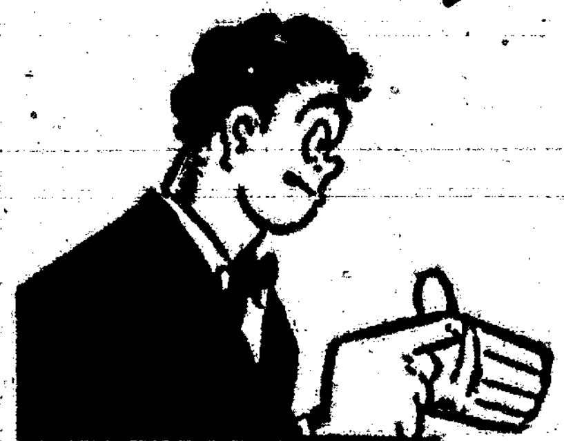
"On the level folks, we've all got to buy more War Bonds! Let's top that 10% by New Year's."