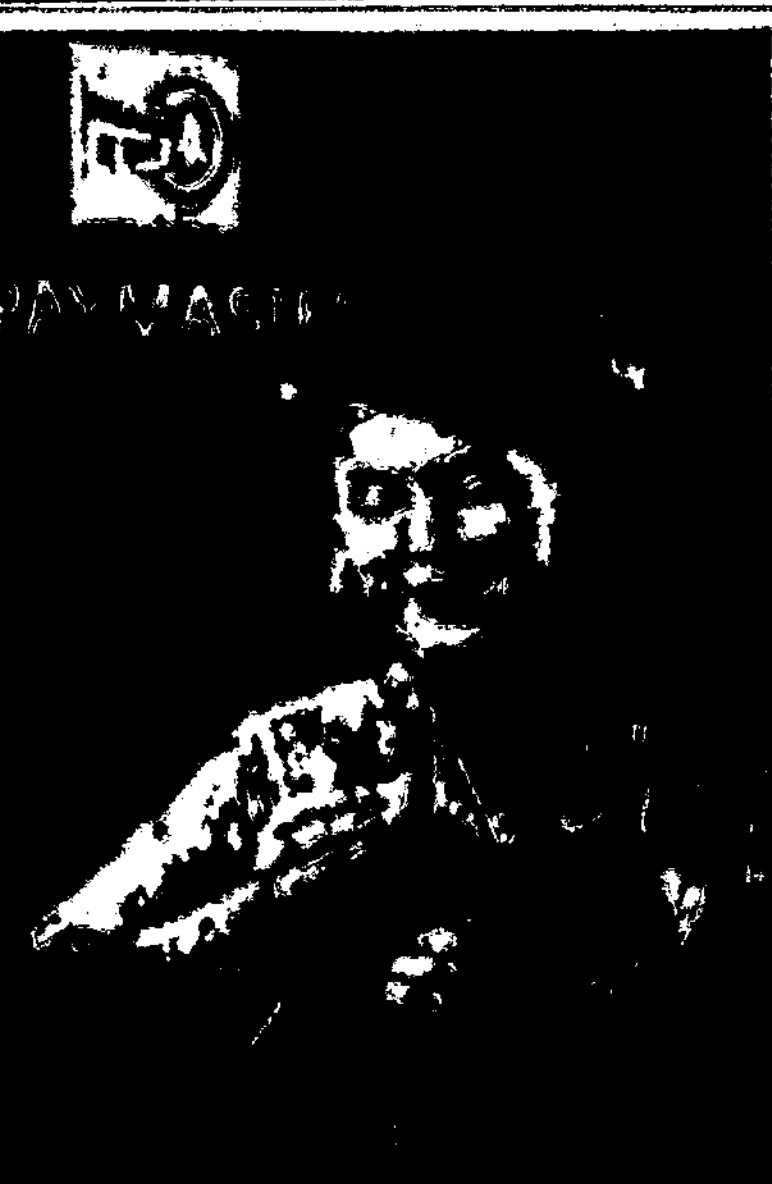
Proud of her investment in the American way of life and equally proud of the grip of war production on her face and arms, the young lady in this "Women At War Week" poster symbolizes one of the great sources of women at war.