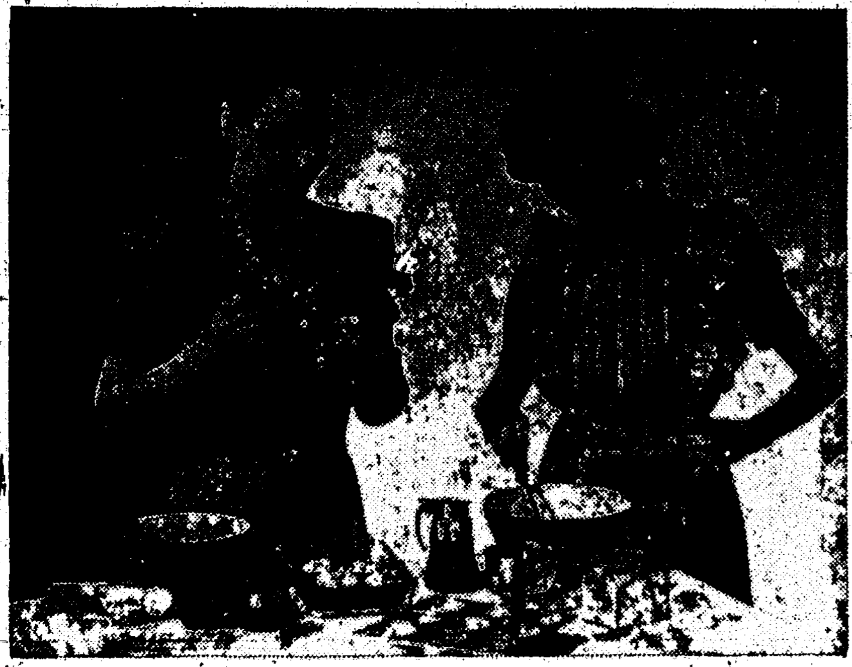
A Little Sugar, but a Lot of Sweetness