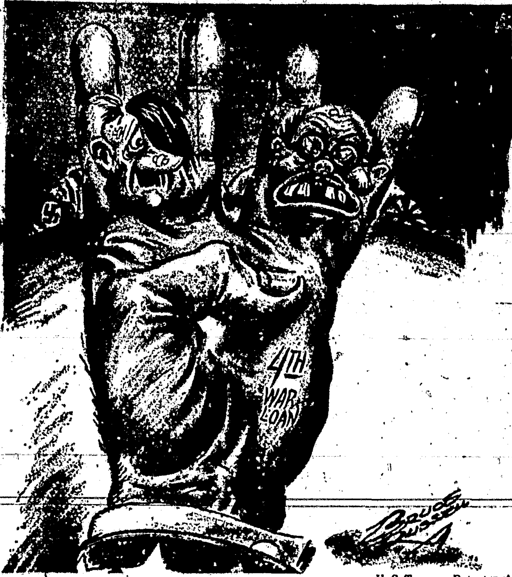
U. S. Treasury Department