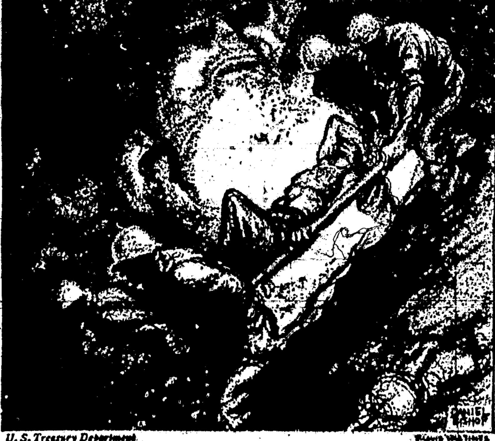
U. S. Treasury Department