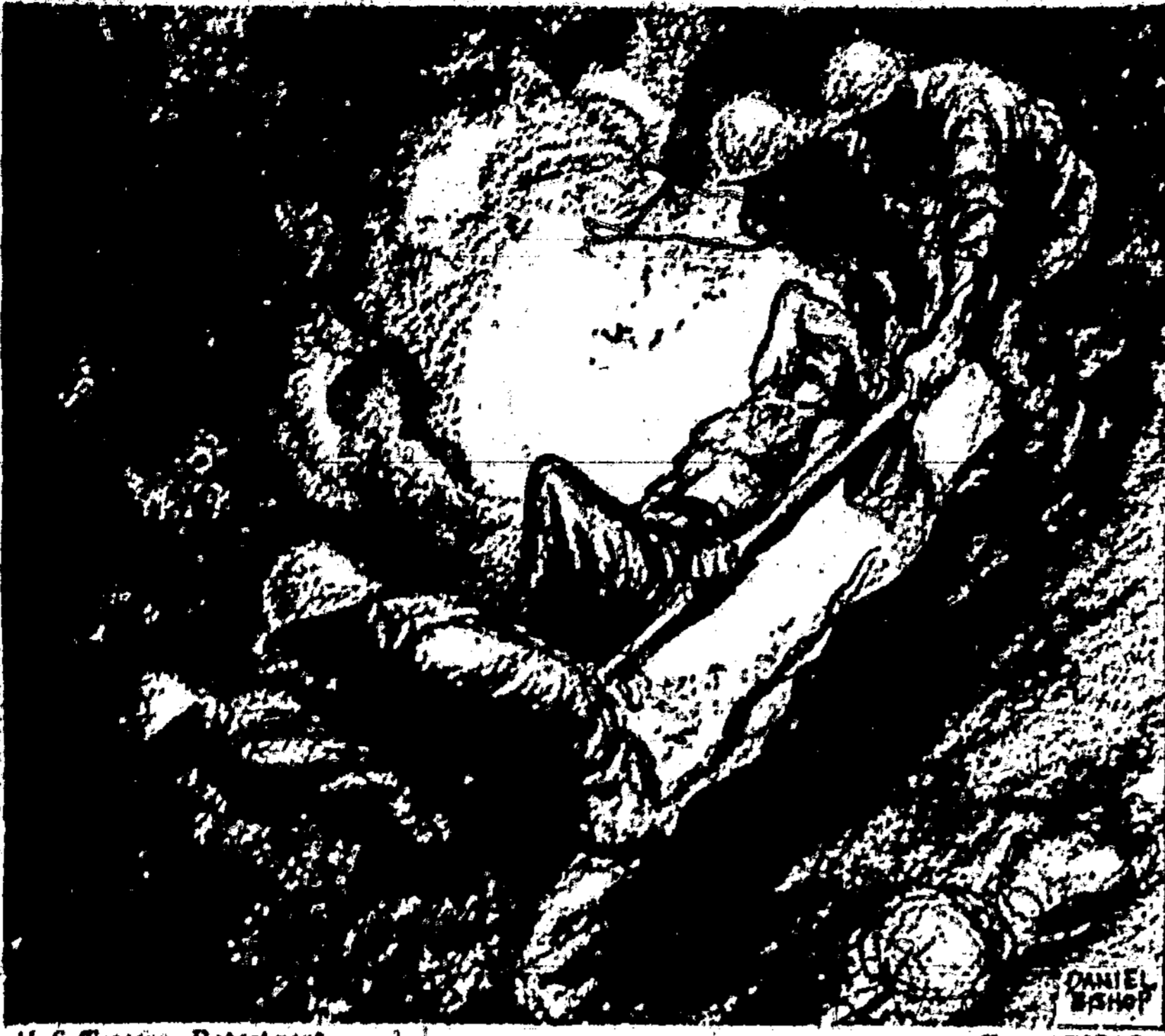
U. S. Treasury Department