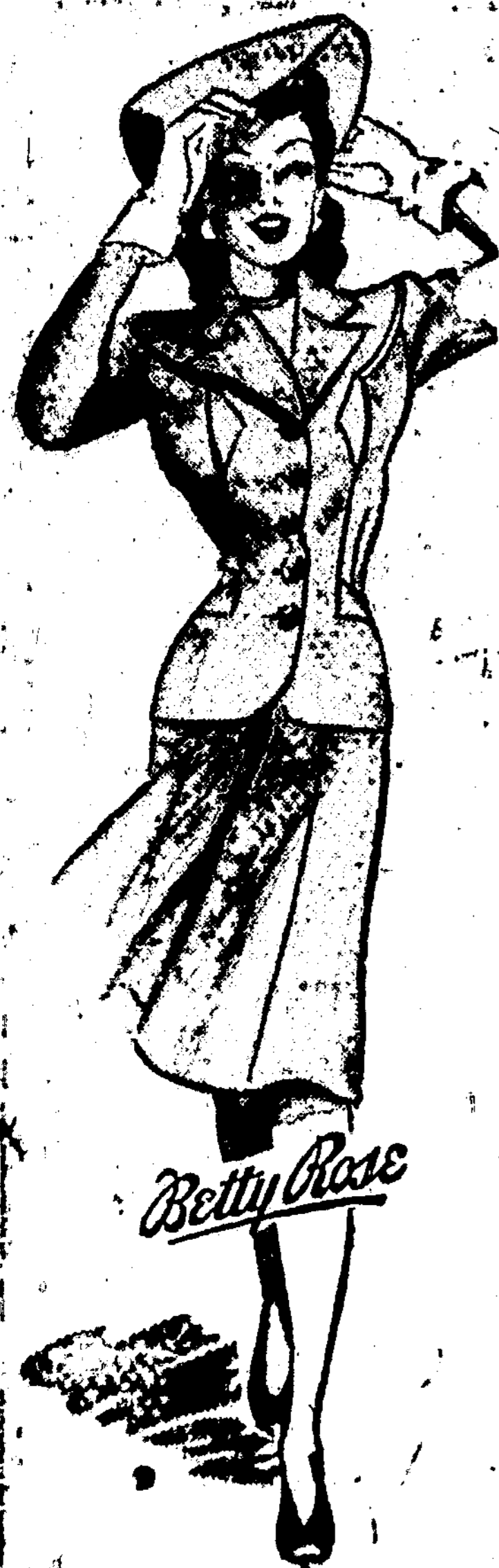
BURKE GIFT SHOP