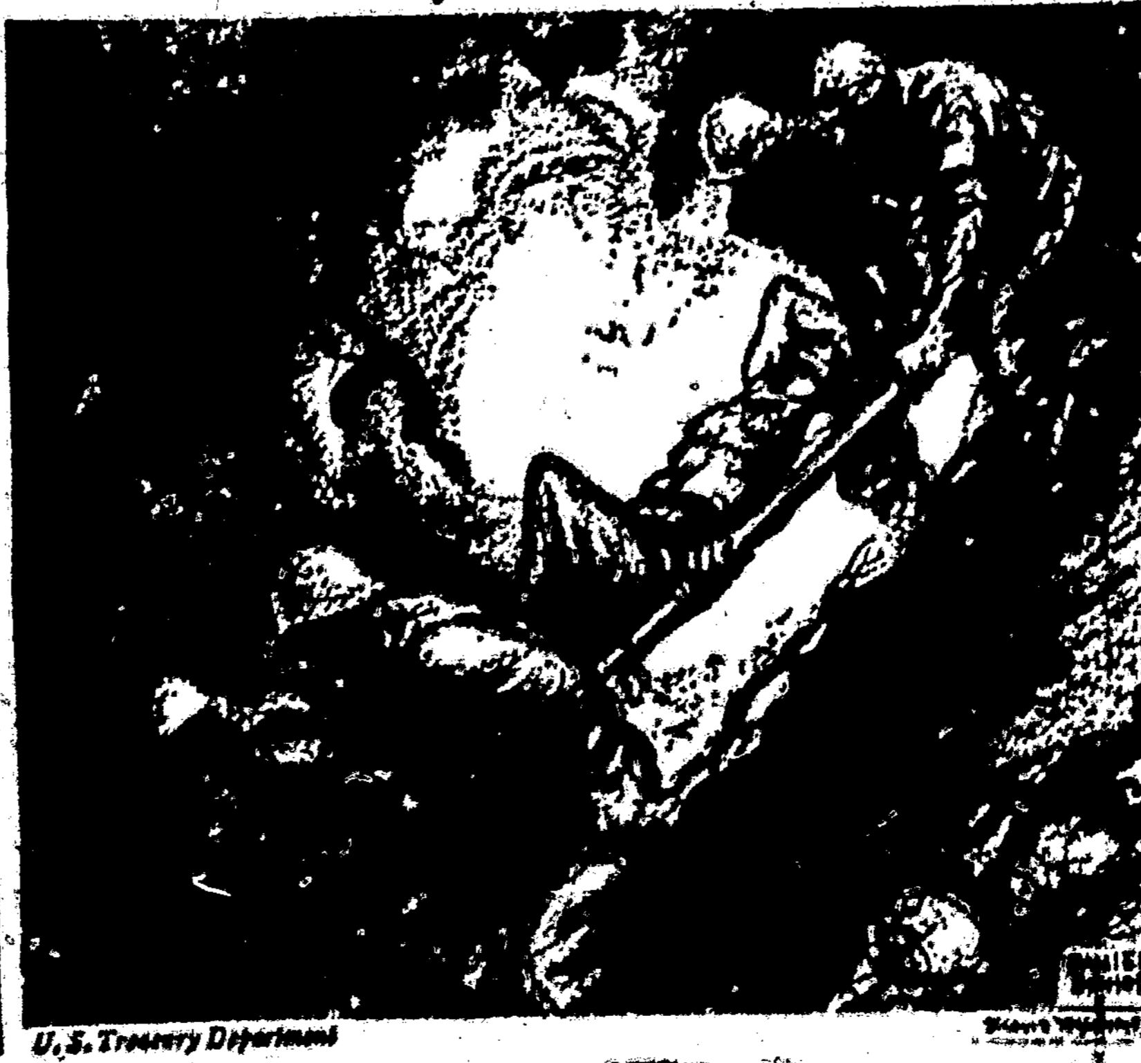
U. S. Treasury Department