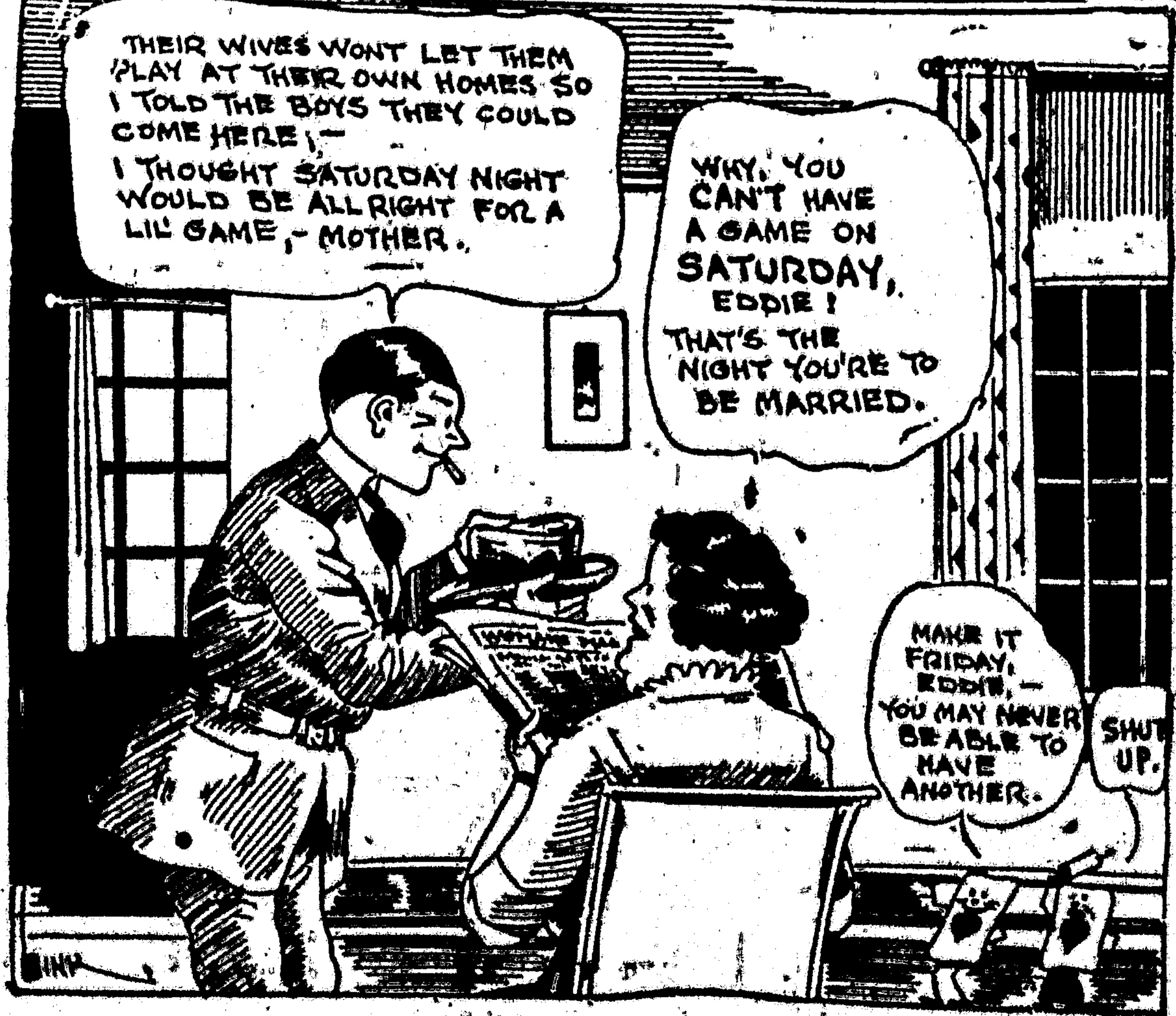
"THAT LITTLE GAME"