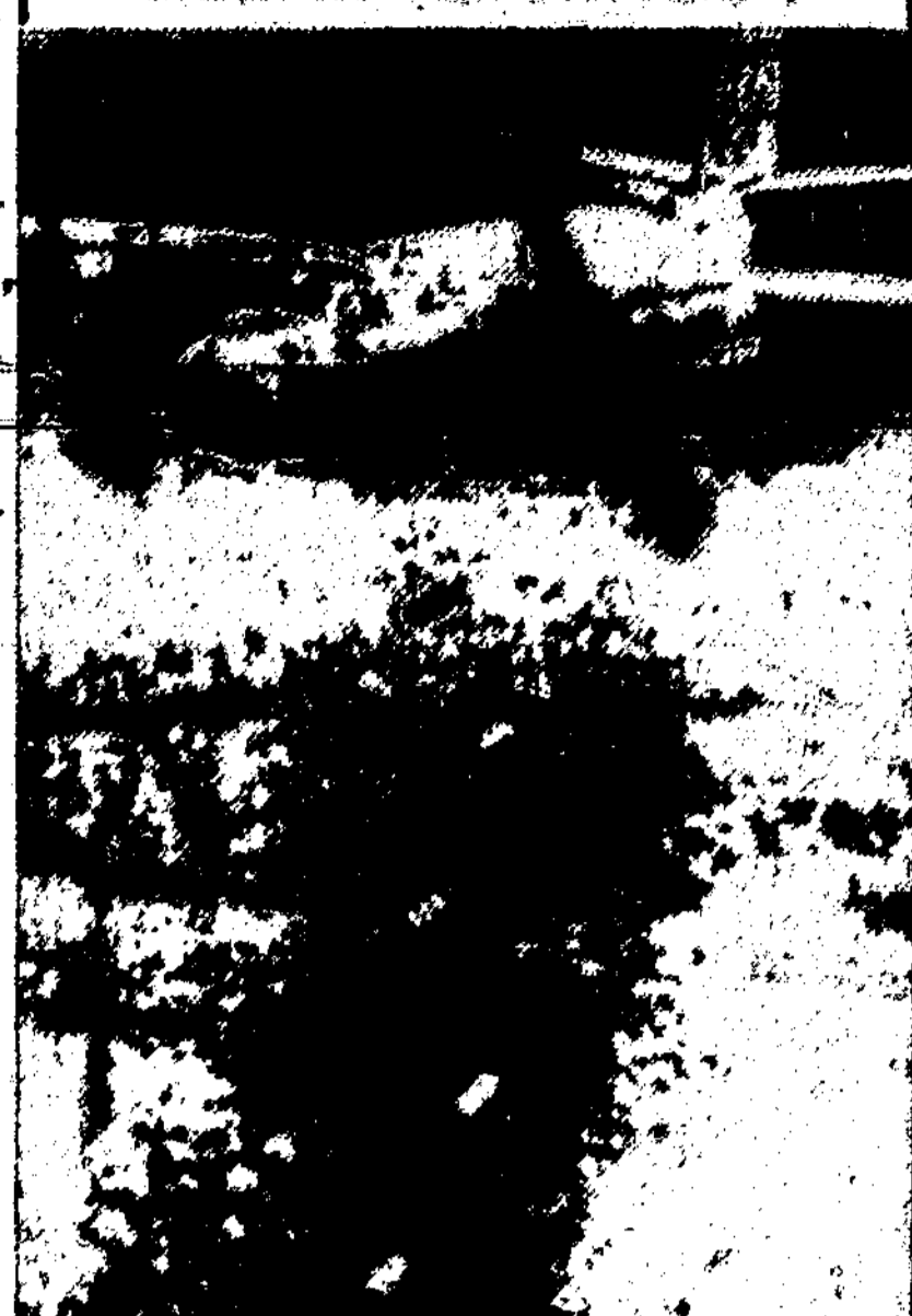
Army Air Corps Photo B-28 Marauder of the Mediterranean Allied Air Forces showers destruction on railroad yards at Florence, Italy. The bomber and the seven bombs in mid-air were purchased with War Bond funds over here. U. S. Treasury Department

C. H. Murray "Guarantees Water" Well Drilling and Repairing "We Go Anywhere" Capitan, New Mexico