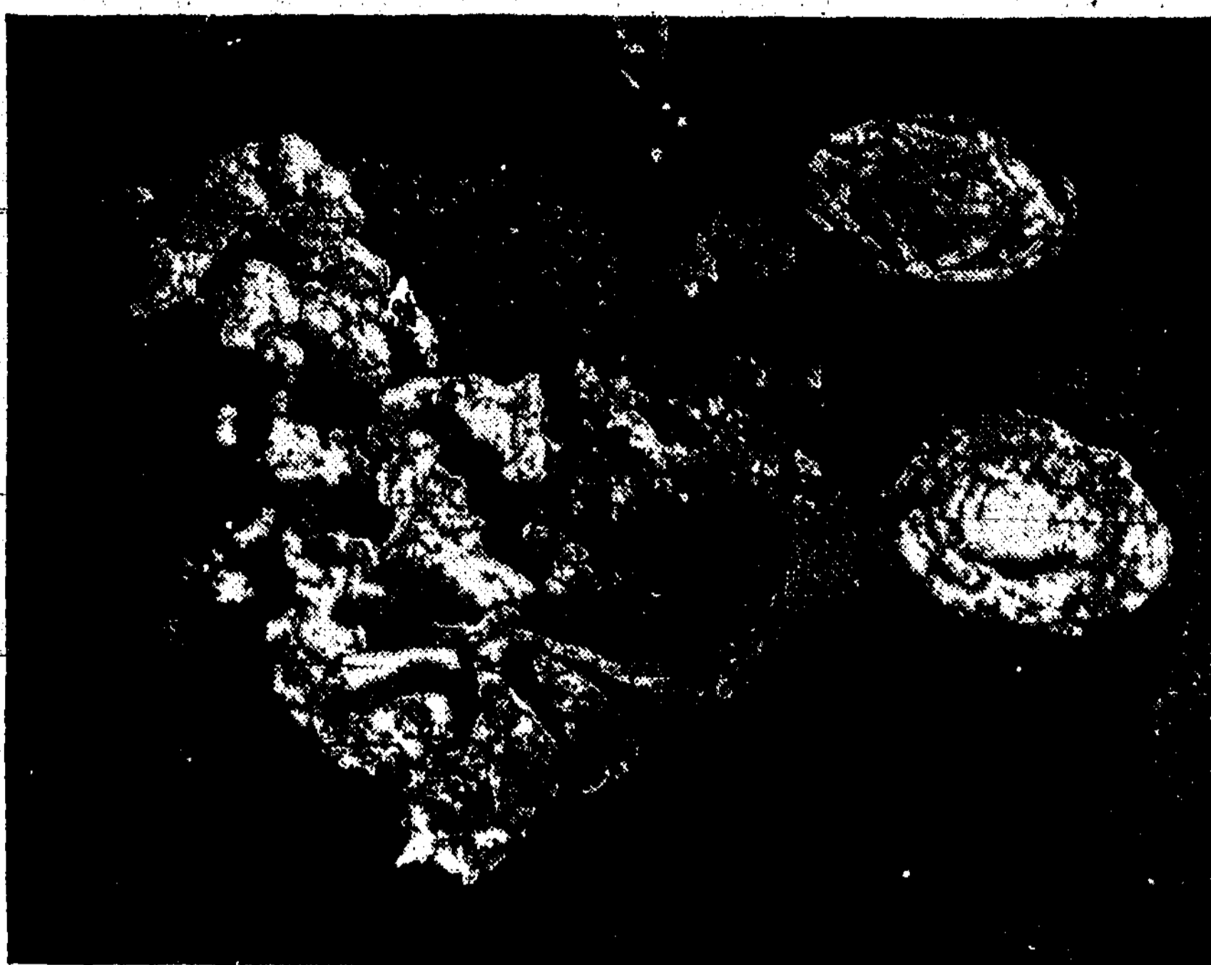
Toast to Good Health . . . Raw Vegetables! (See Recipes Below)