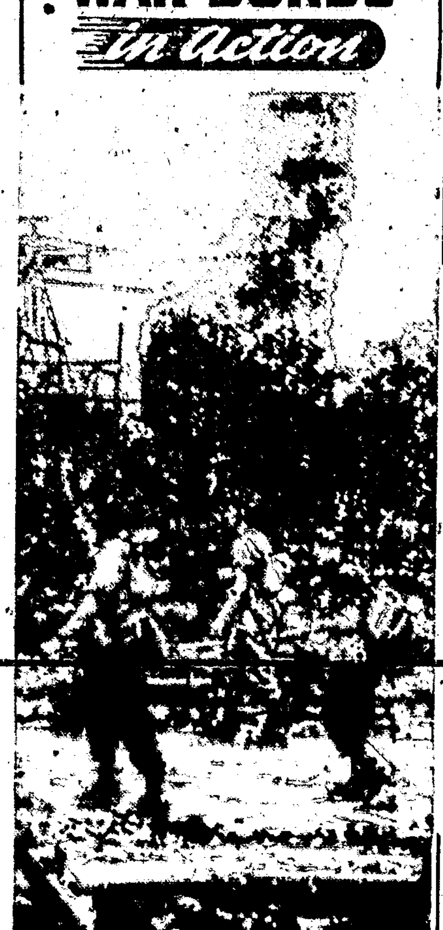
Help for Australians. U. S. Amphibious units that War Bonds helped to equip put these Aussies ashore to drive the Nips from Tarakan, Borneo.