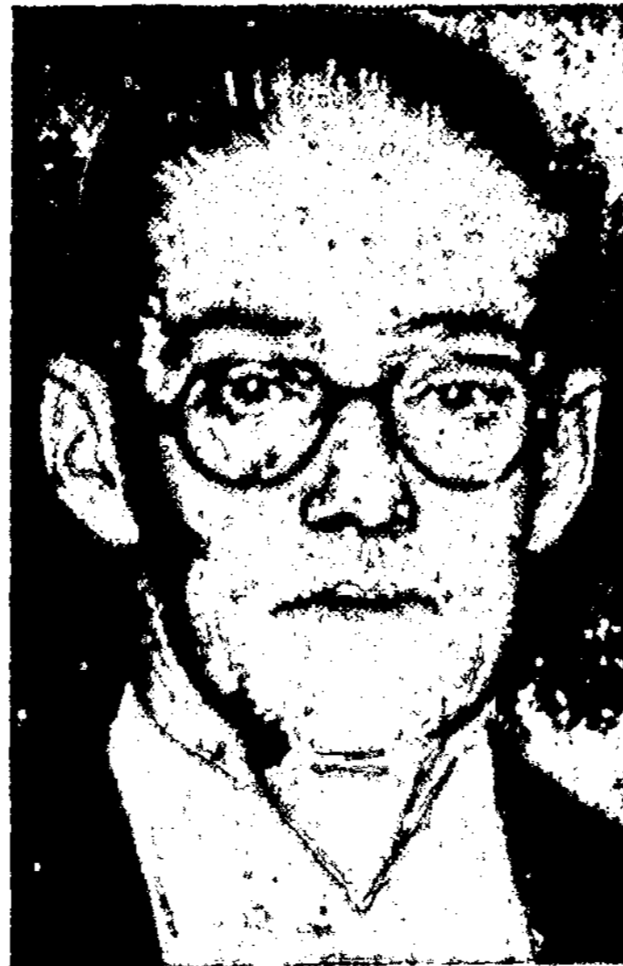
Baron Nuffield, who is Sir William Morris, head of a vast manufacturing organization including automobile plants, export companies, a publishing house and affiliated subsidiaries, donated $10,000,000 to stimulate employment in Great Britain's "depressed areas."