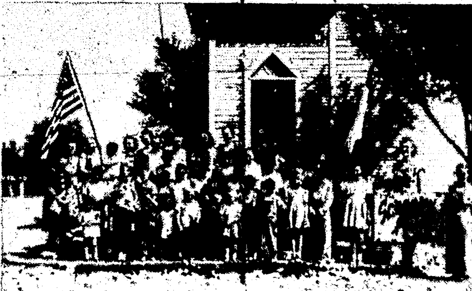
Above are the workers and pupils