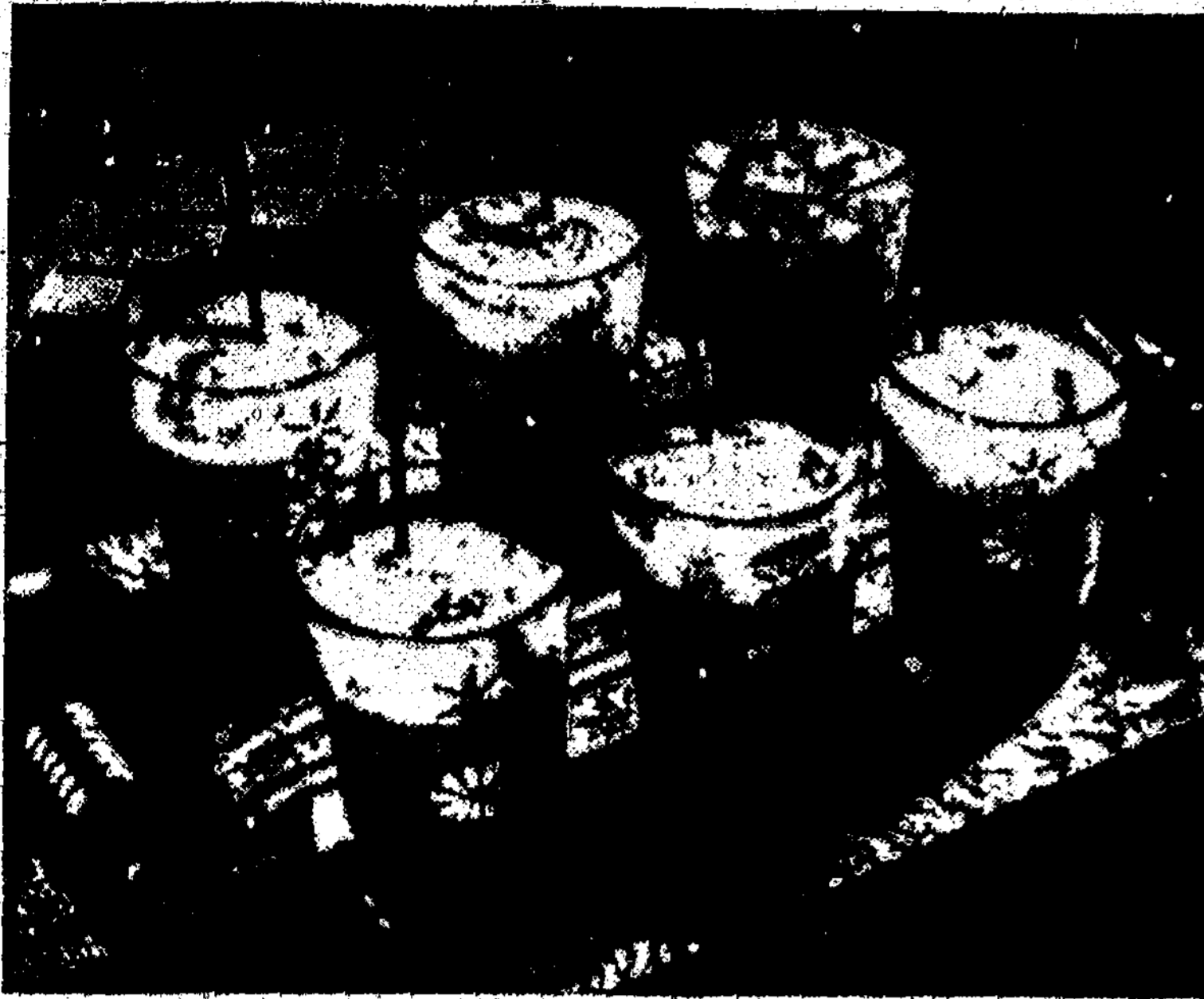
Cool Off With an Egg Julep! (See recipe below.)