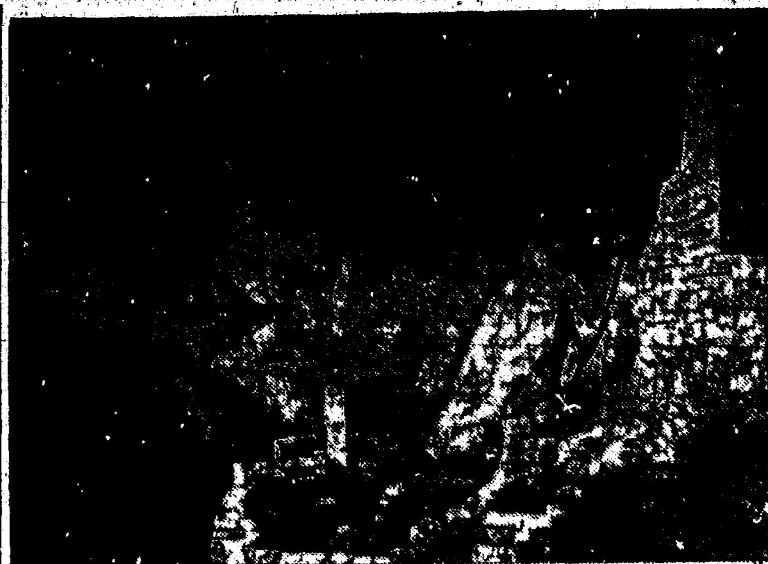
ANCIENT VILLAGES PRESERVED . . . Fascinating villages, built by Indians centuries ago in inaccessible caves perched high in canyon walls, are preserved in Mesa Verde National park.

"Why, my dear, we had no ideal. But now I know why Carl has been so attentive. And that sparkle in your eyes, Connie. All the signs. . . The sparkle in her eyes. The glow. Carl Bullard's body was on the sand at last, tumbling awkwardly, shapelessly. My cigarette dropped into the water. I heard it hiss. And then I dived in without taking time to stand. Carl Bullard's grip nearly broke my arm. . .