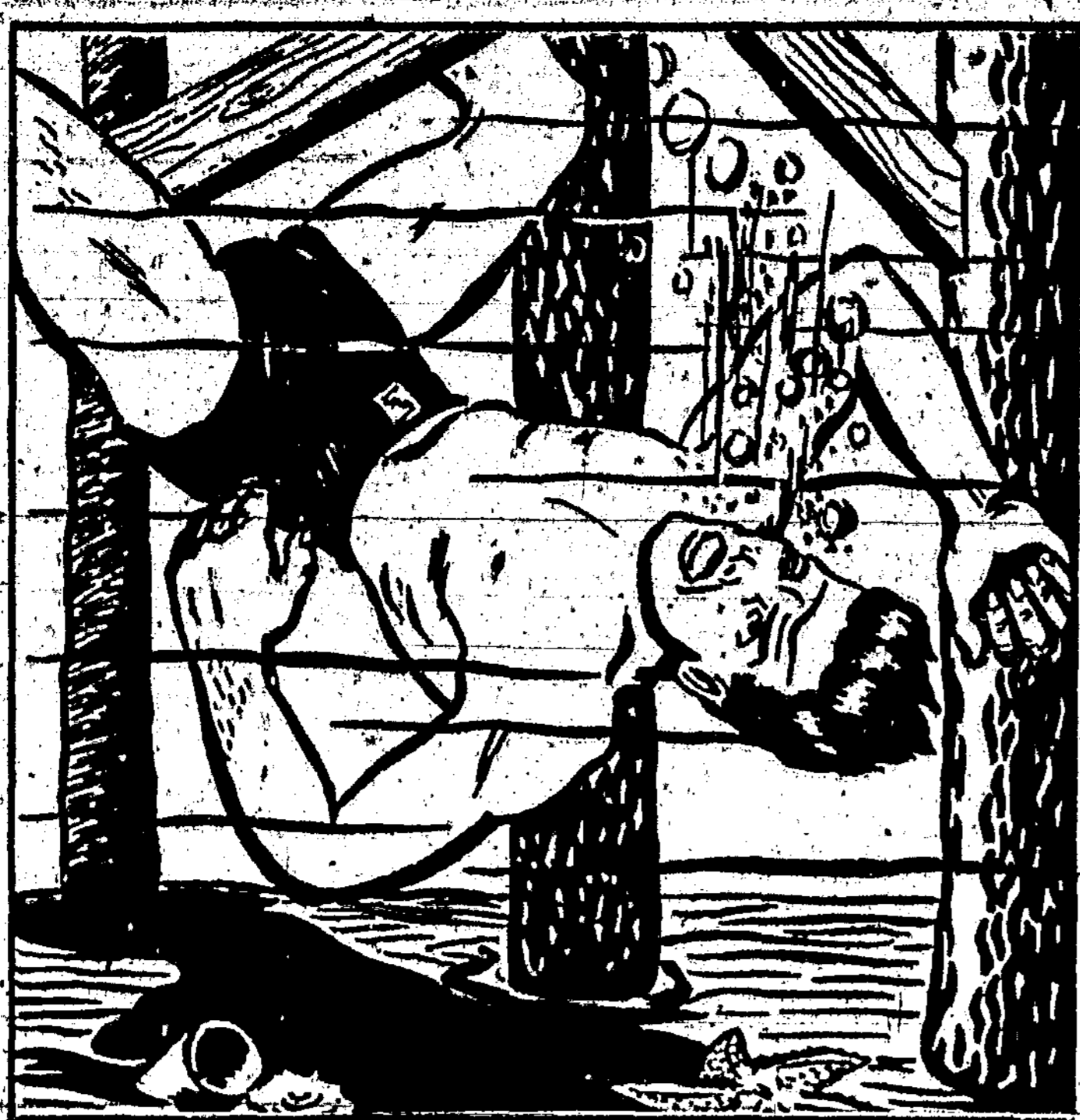
How long would it be before he touched the sand? Two seconds? Ten? But how eternally long a second can be...