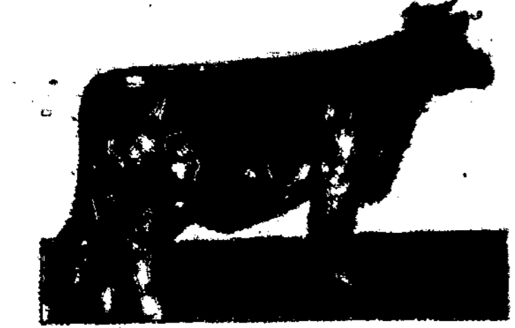
at a private sale to Rehder Bros., Bladbrook, Ia.

A new record price for Holstein-Friesian cows was received at a Cary, Ill., sale, when Dunloggin Mistress La Princess brought $23,500 to her consignor, Elmwood Farms, Lake Forest, Ill. She was purchased by Wern Farms, Waukegan, Wis., which later resold her