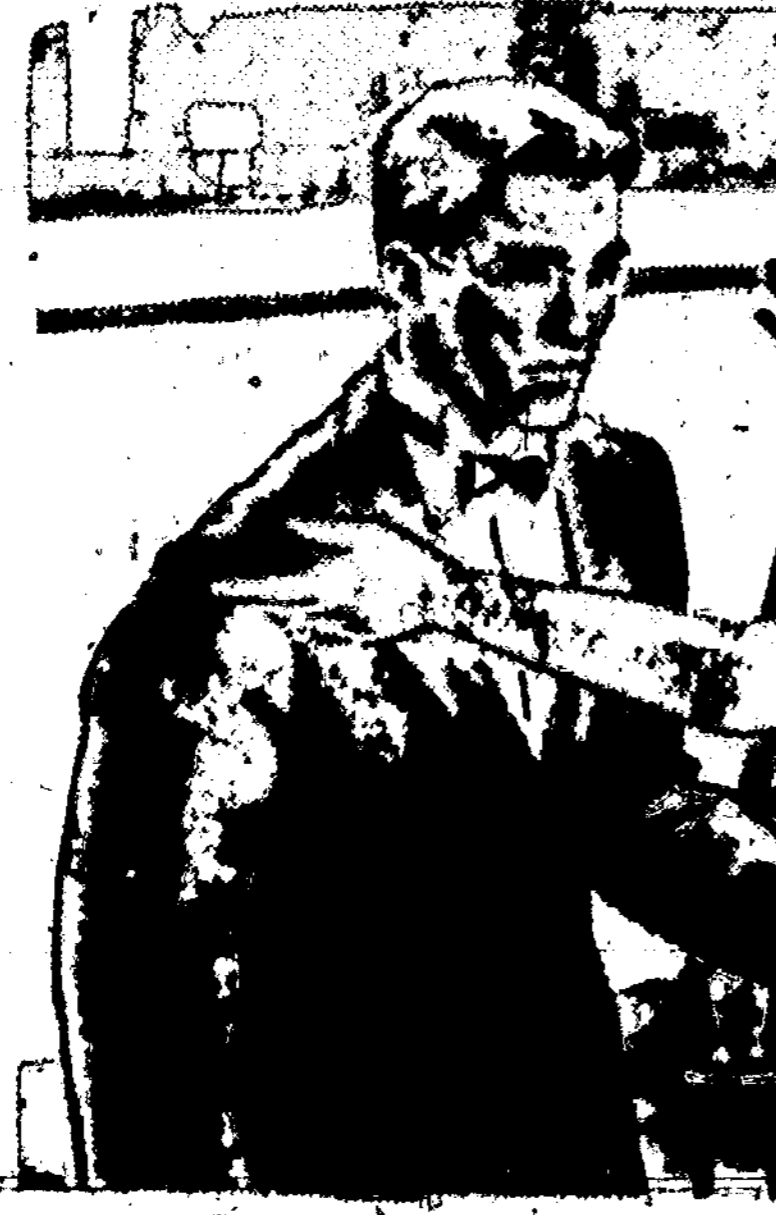
"How did it go?" she cried. I shouldn't have told her.