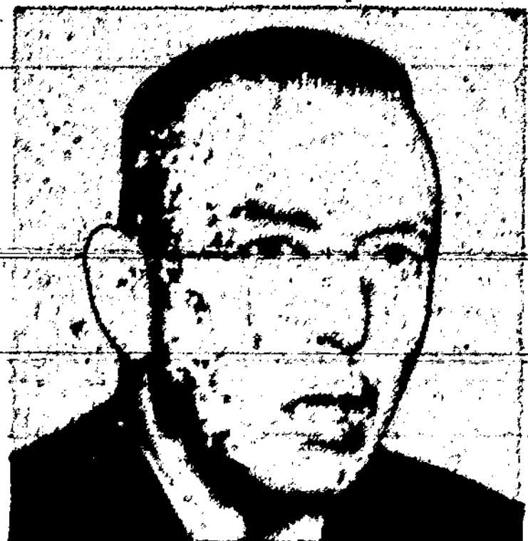
Admiral Arthur W. Radford took the stand before the house armed services committee to testify that current defense plans and military setup relegate the navy to a role "useless and inadequate" in the event of an atomic war.