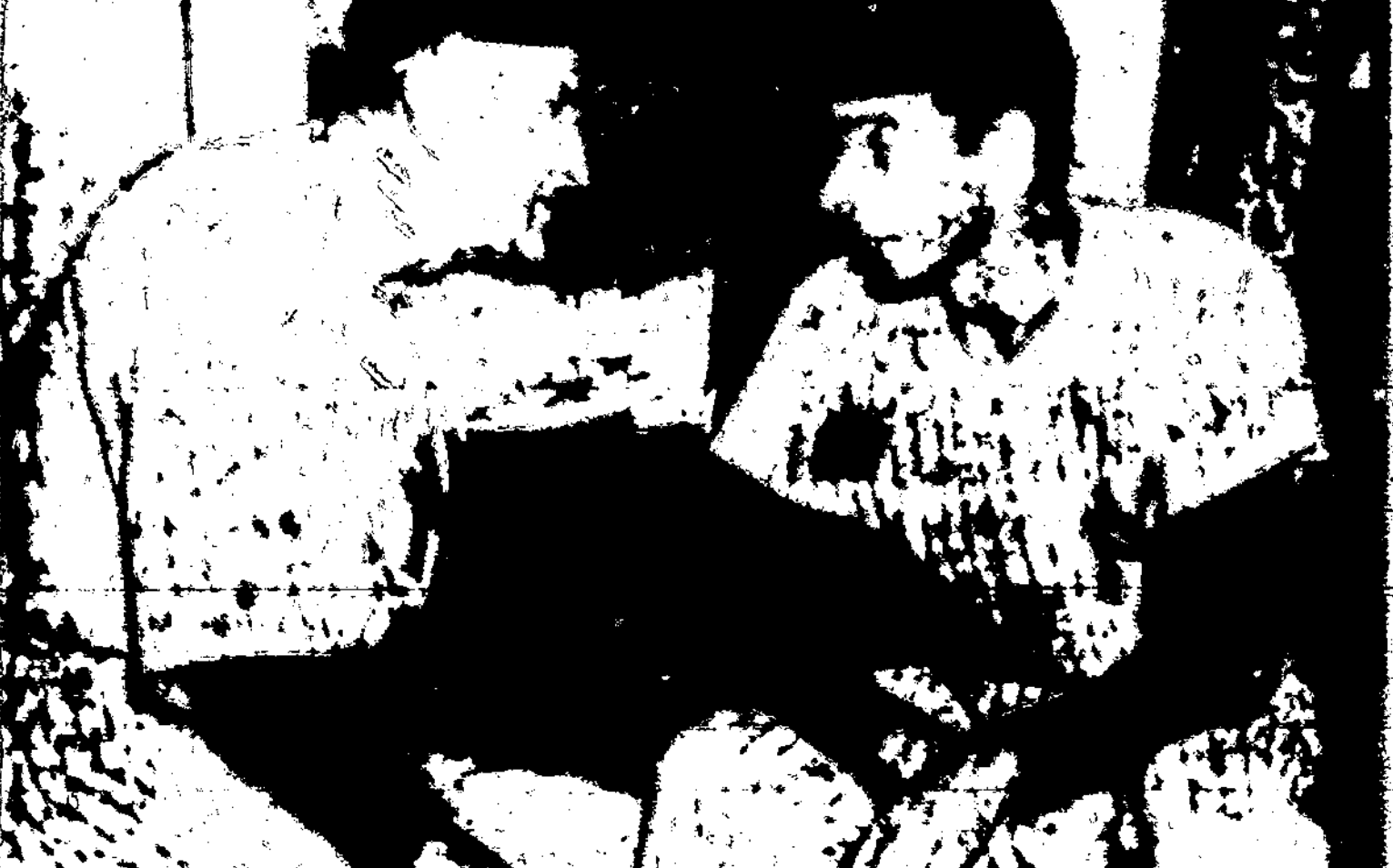
DEPENDING ON JOE . . . New York Yankees' manager, who has been up to his neck in woe all season, puts a hand on the shoulder of his recuperating slugger, Joe DiMaggio, and tells him that the fate of the Yankees in the World Series rests on his shoulders. Joe returned to the field after a siege of virus pneumonia just in time to help New York win the pennant and the series. The Yankees, now world champs, were hounded by injuries all season.