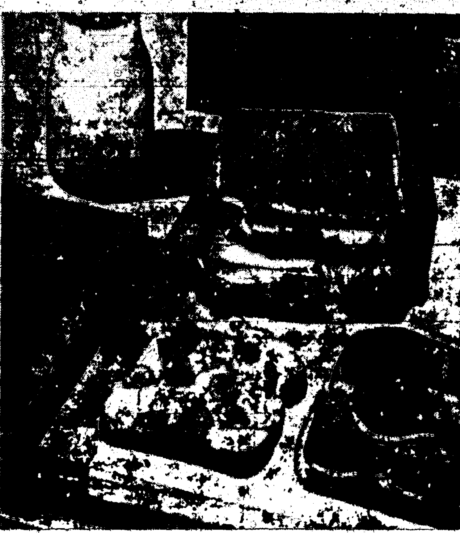
Variety Gives Lunch Boxes Interest (See Recipes Below)