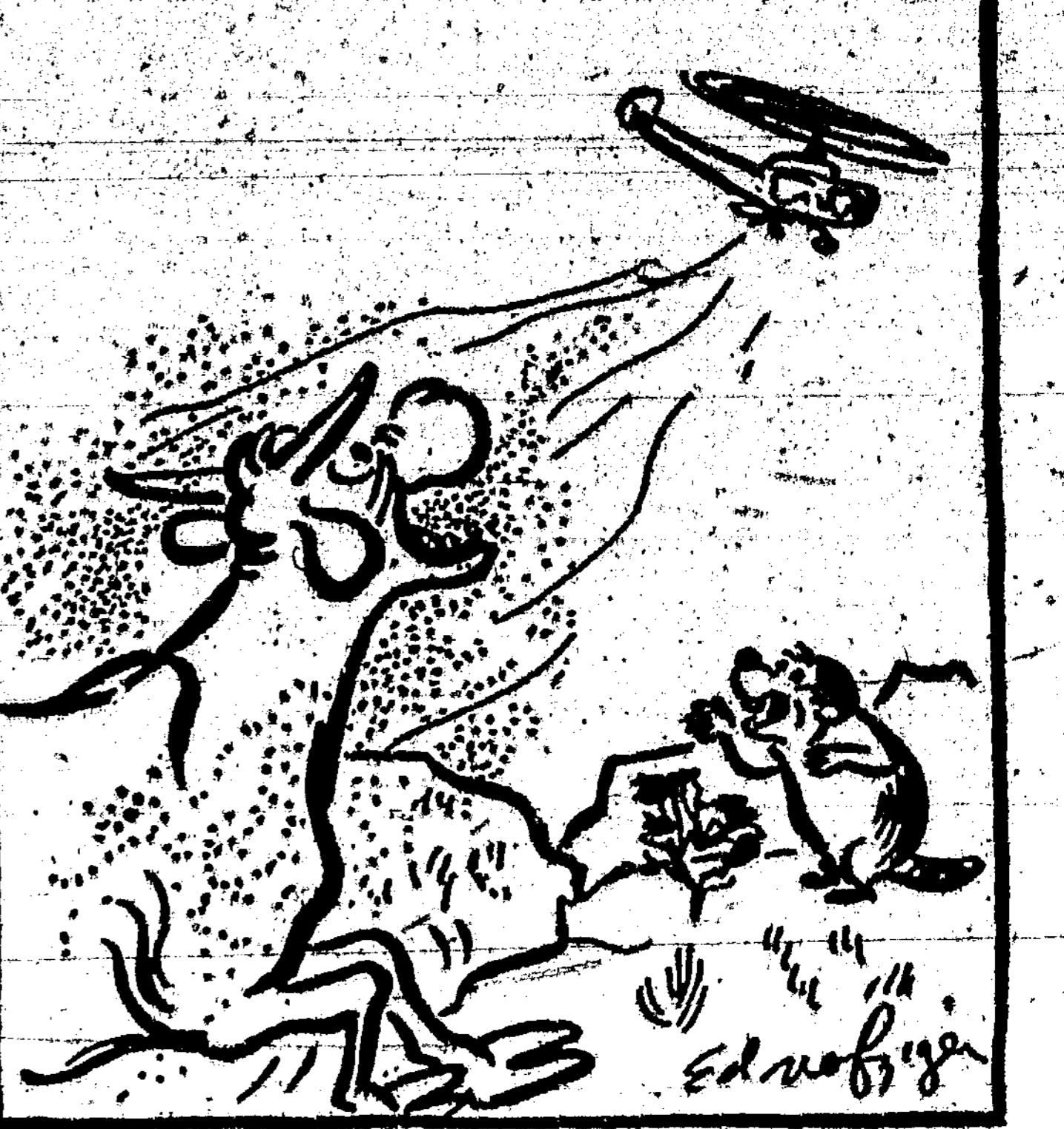
Forest Service, U. S. Department of Agriculture