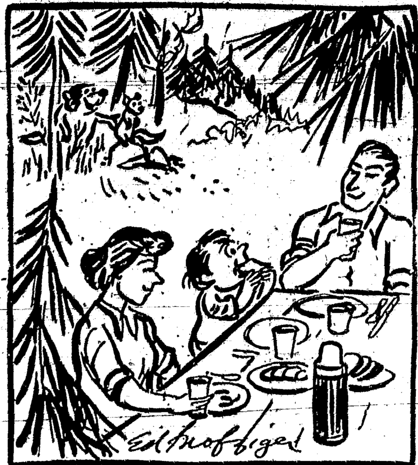
There are 152 national forests dedicated to the greatest good, for the greatest number for the longest time—makes you proud of your country, doesn't it?