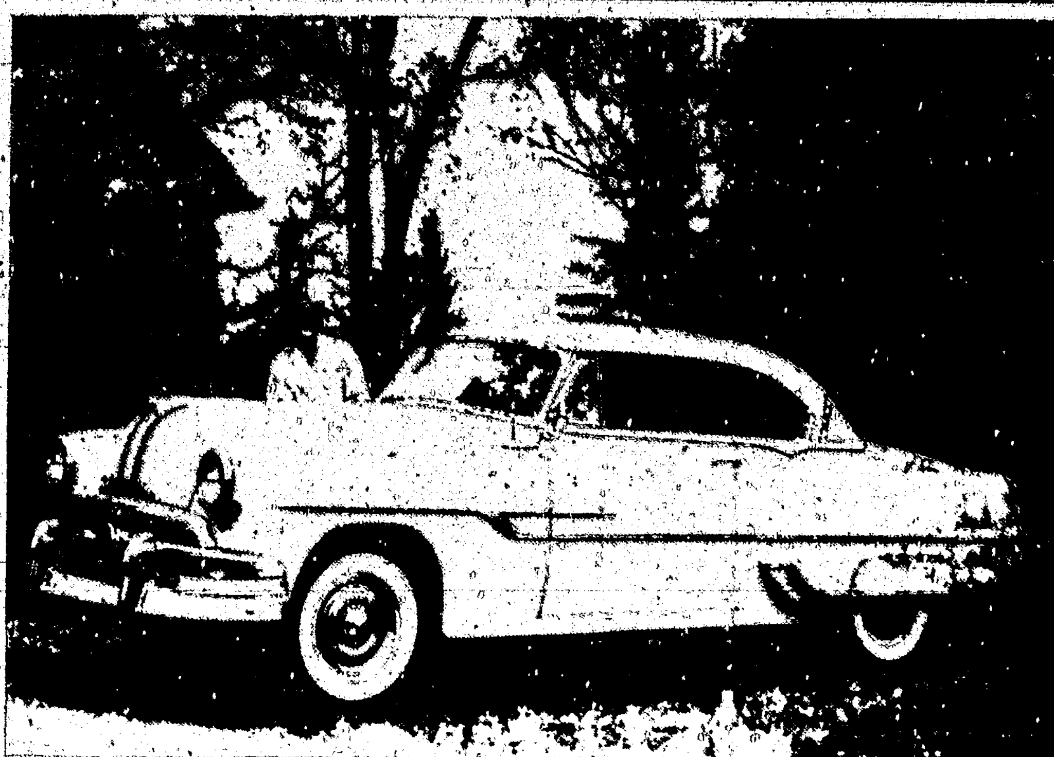
In nationwide dealer showings, Pontiac Division of General Motors today introduced its new line of Dual-Streak Chieftain models, featuring longer wheelbase, increased vision and new curve-control front suspension. Advanced styling is marked by smooth contours, rear fender fin and high deck lid, one-piece curved windshield, wrap-around one-piece rear windows, roomier interiors and entirely new radiator grille and chrome treatment. Above is the new Custom Catalina, one of 11 body types in three-Chieftain series: Special, De-Luxe and Custom. Wheelbase for all series is 122 inches, with Power Steering as optional equipment.