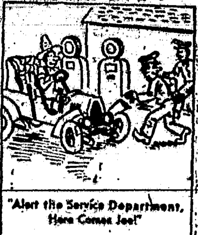
"Alert the Service Department, Here Comes Ice!"

He has been getting his service here for years, and the old buggy still runs like a top.