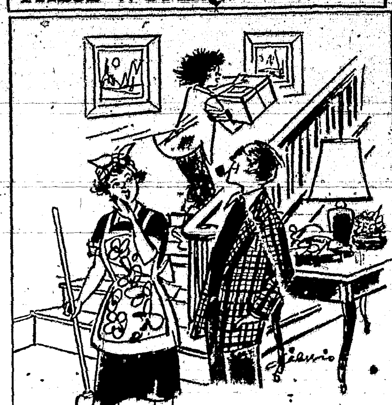
"When she comes back down, don't faint. She just bought a new dress!"