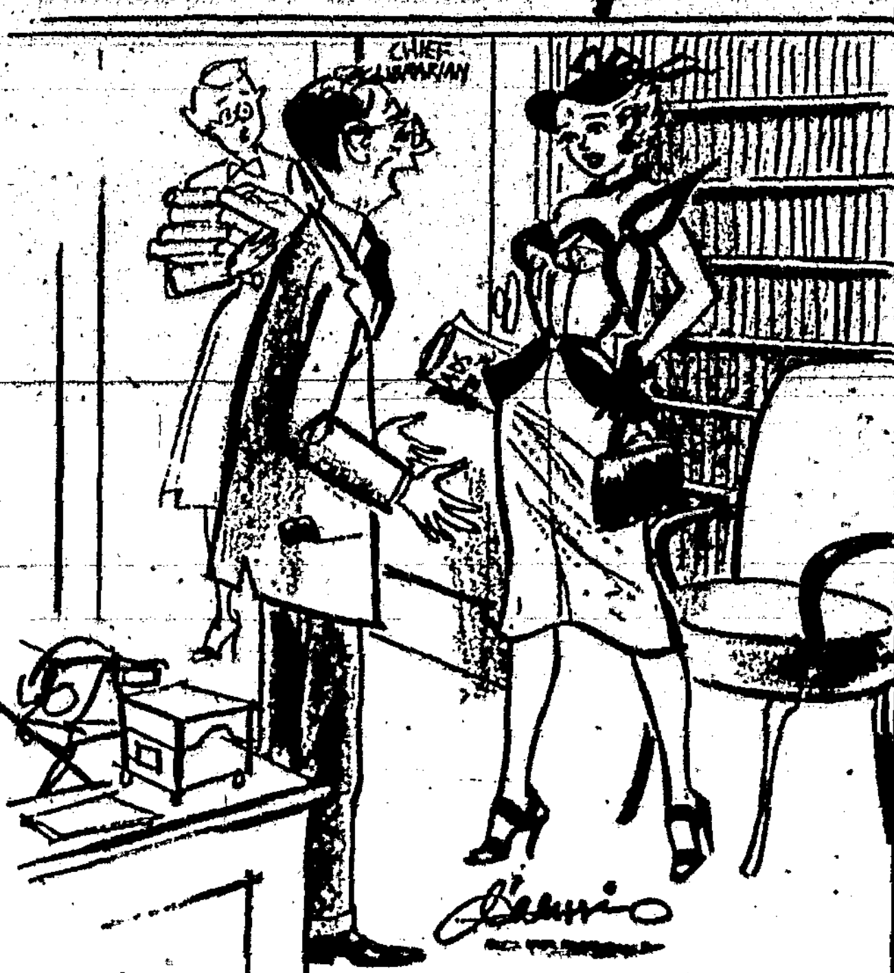
"You read the advertisement wrong, Miss. We called for a model girl, not a girl model!"