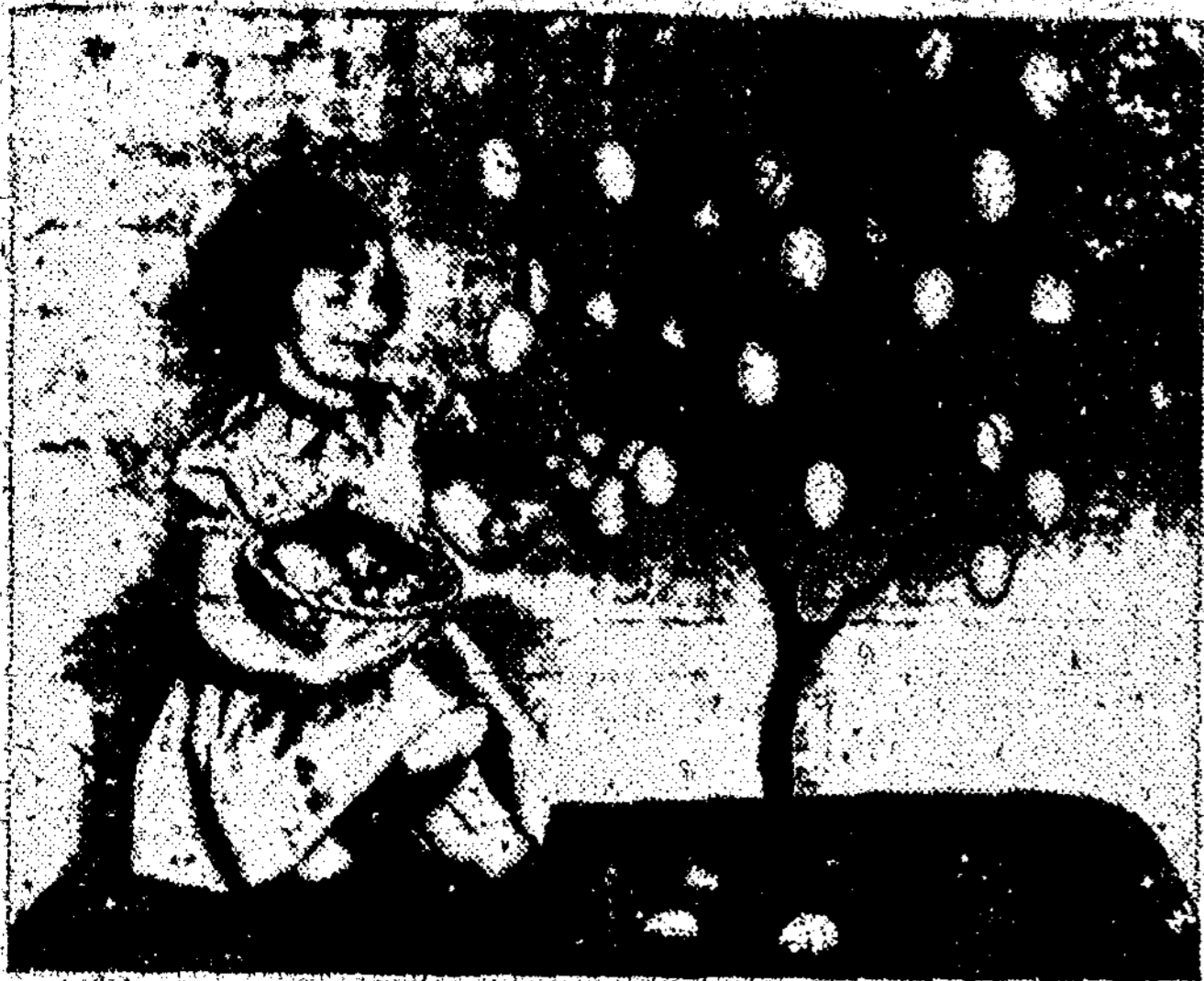
"What is more fun than an Easter Egg Tree at Easter time?" asks 5-year-old Janice Curtis of New York. "This tree is gaily decorated with Easter Eggs dyed in bright colors and fastened with adhesive tape. Almost anyone can make such a tree from a small bare limb or shrub and decorate it for Easter fun, says the Poultry and Egg National Board, which adds that you can eat the decorations on an Easter Egg Tree."