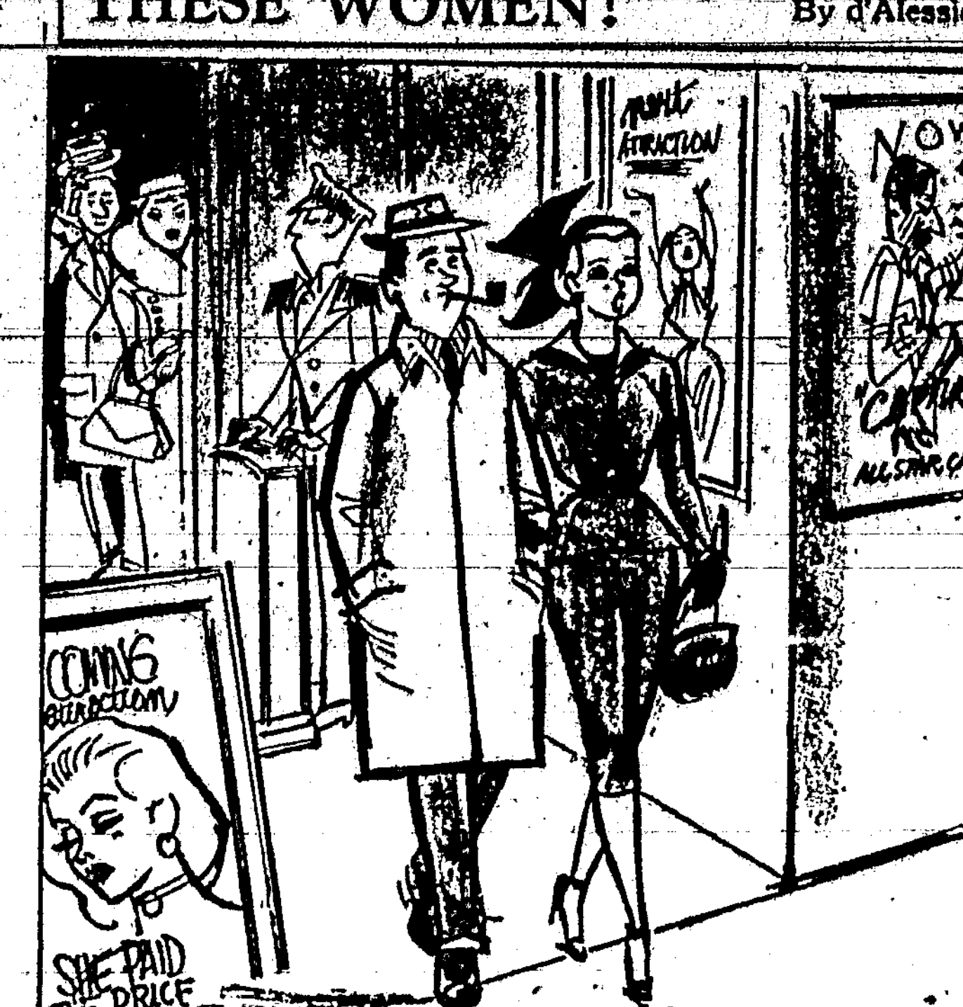
"The picture was a disappointment. It was so much like the book, I knew what was coming next!"