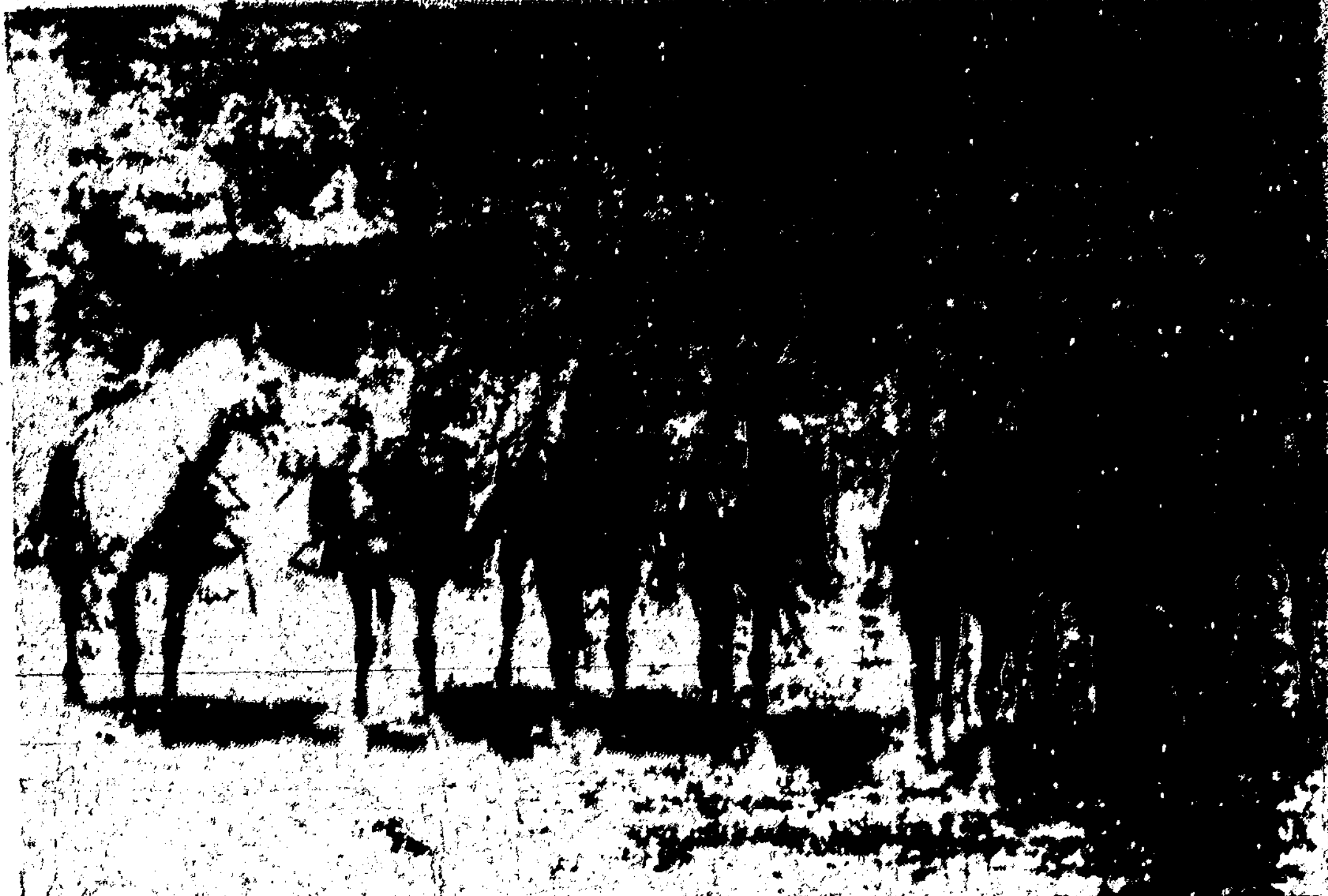
Pictured above is a fourth group of horsemen—members of the New Mexico Mounted Patrol, Troop 5. They came from many parts of the County to take part in the Troop's annual