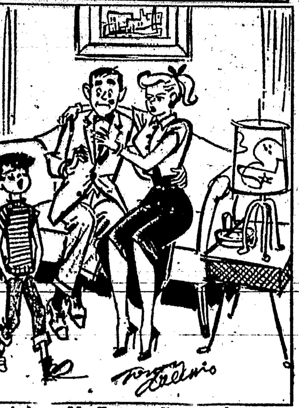
"Don't mind me, Mr. Foster—I've seen her kiss follows before!"