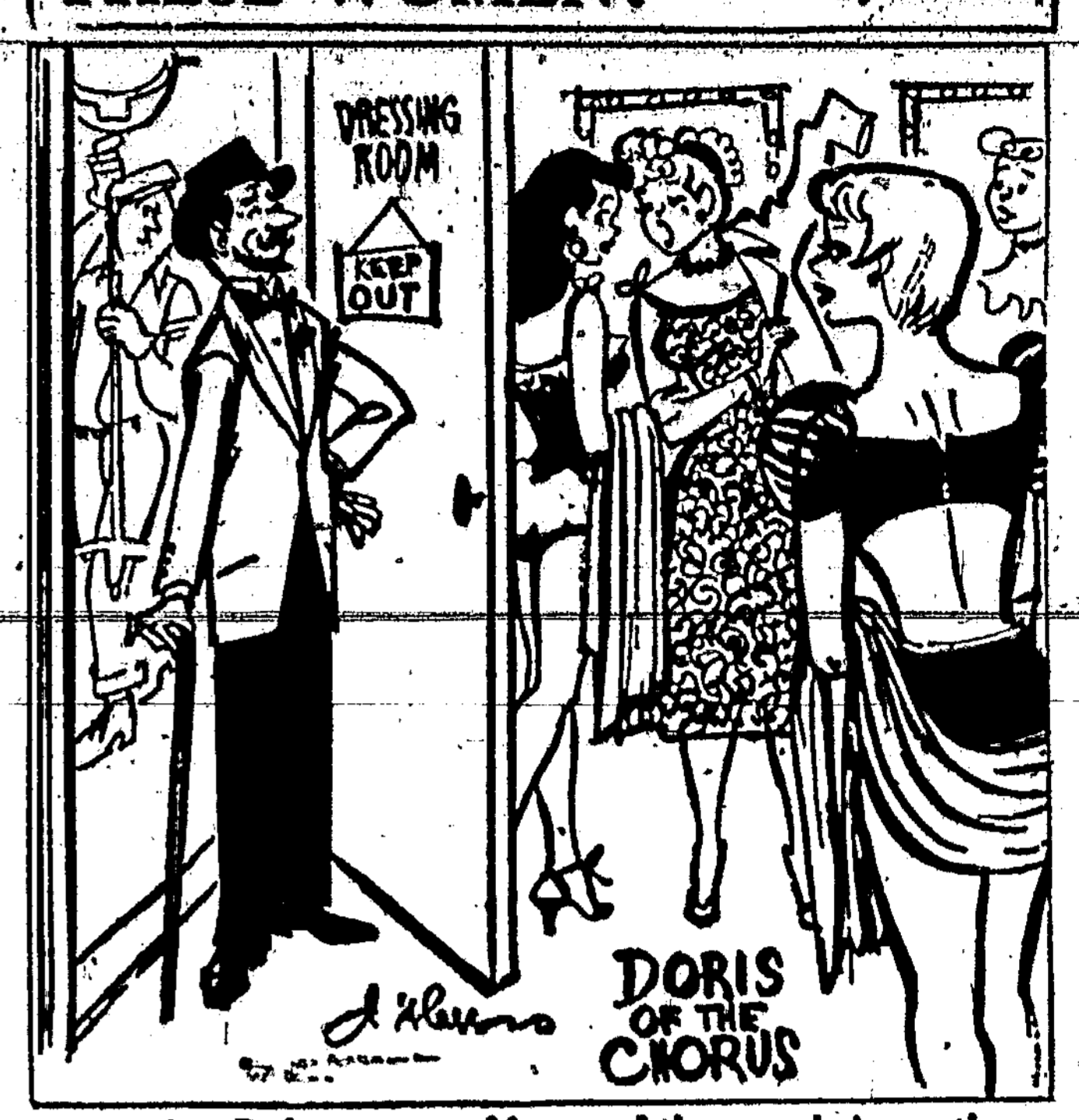
"He's a Duke or something, and they say he's worth 27,000,000 francs... quick, how much is that in money?"