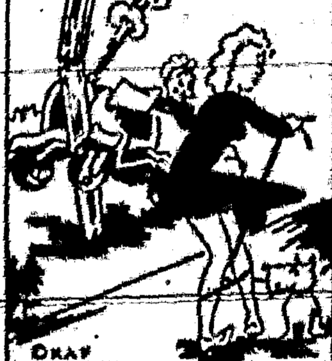
"Here's seen a dog like that in year."

Don't be up a tree because you've run out of gas or the battery is dry. Get the habit of letting us check it for you. We're these three checked just time you're down out way.