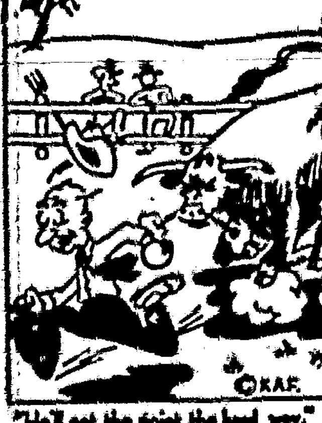
"He'll get the point the hard way."

Some folks are like that... but others take good advice and check on their car BEFORE it happens. Check that battery right away... drive in and see us.