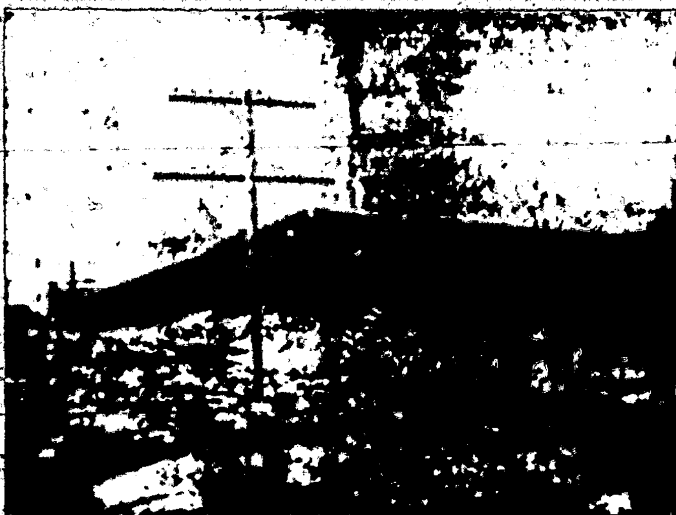
Above, 24 cars of a Southern Pacific freight train were derailed Monday noon at Robsart siding, eight miles north of Carrizozo. The cars were part of a 44-car train, enroute south.

Trains resumed using the track at 11:30 a.m. Tuesday, with No. 39 Imperial first through. Two Golden State trains were routed through Belen Monday over Santa Fe tracks.