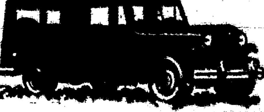
The Jeep Utility Wagon... dual purpose vehicle for business and family.