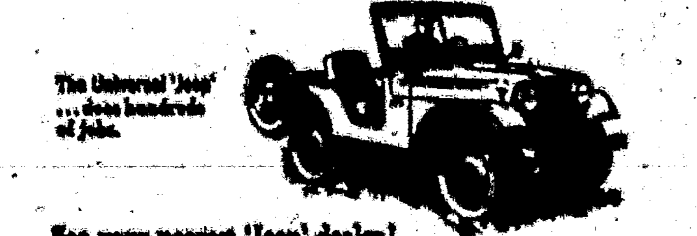
The Universal Jeep... does hundreds of jobs.