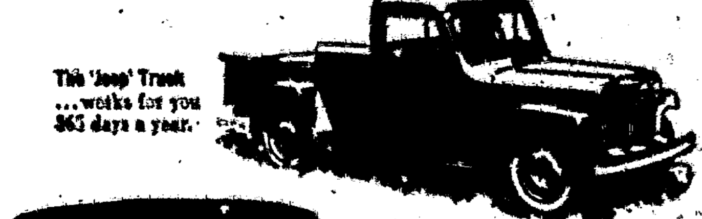
This Jeep Truck... works for you 365 days a year.