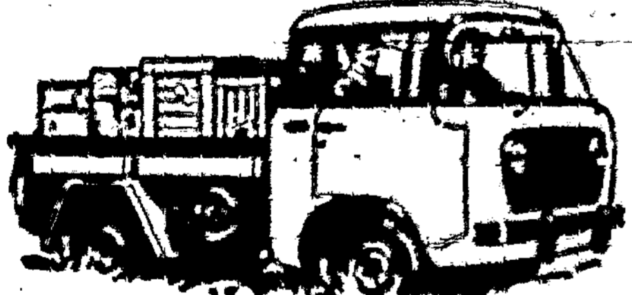
The New Forward Control Jeep FC-30... puts a 74" pickup box on a wheelbase only 81" long.