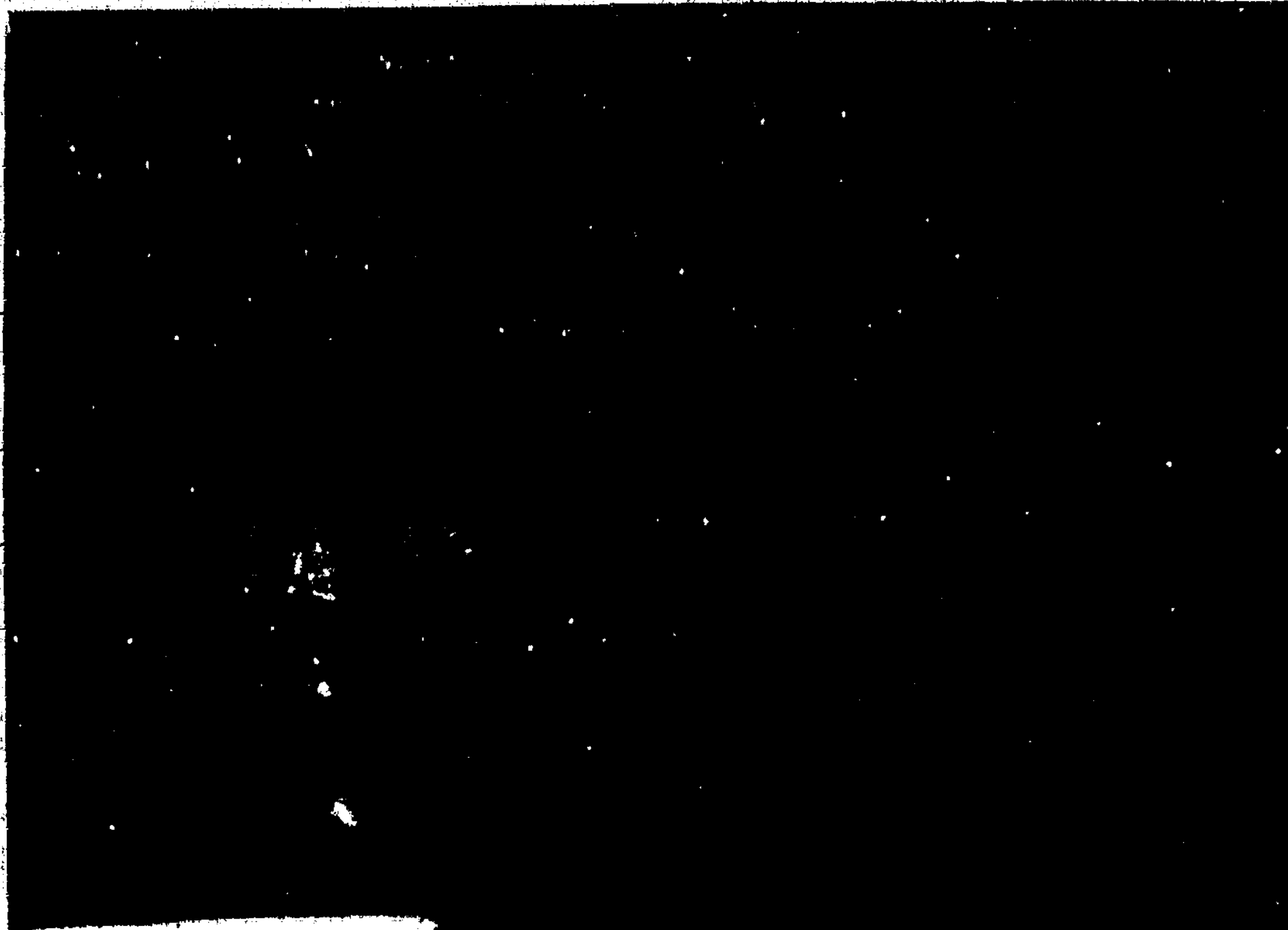
The Bloomer Belles battled down to the wire in an effort to overtake the Mal Pais Mavericks in their charity basketball game for the cancer drive.

Wednesday, April 22, was the opening day of the New Mexico Congress of PTA. 500 parents and educators were on hand at Las Cruces to attend workshops and exchange ideas on how the PTA can be more effective in promoting the welfare and education of our children in New Mexico.