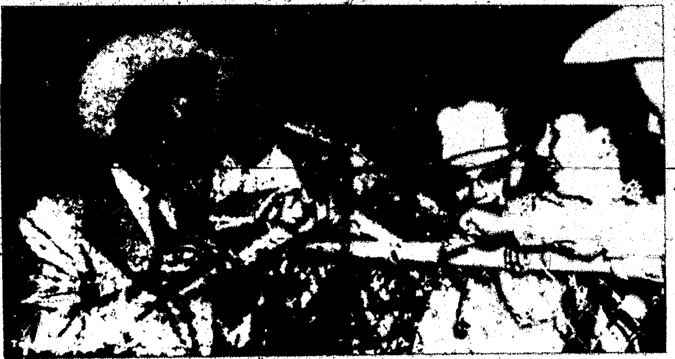
REX ALLEN, the star of 'Frontier Doctor,' is pictured here as he delighted the hearts of the young folks at Ruidoso Downs recently. The gra-