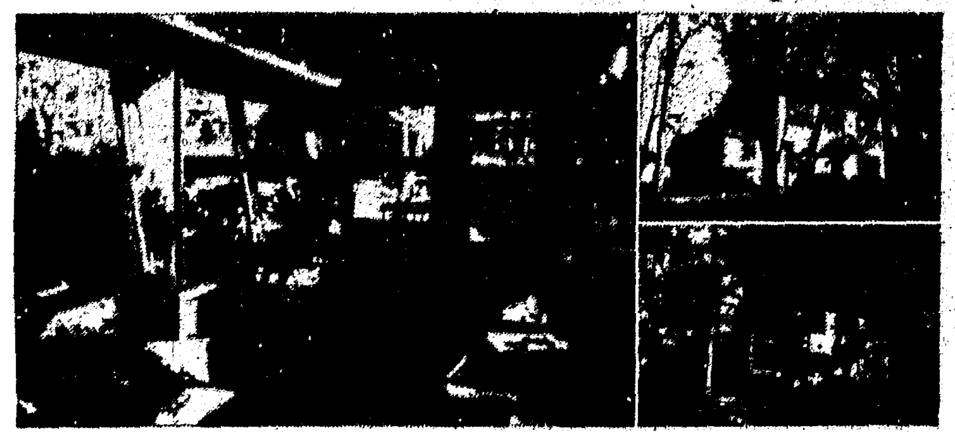
Award-winning porch enclosure in Darien, Conn., features special installation of ponderosa pine windows to create more space, plus heat pump for winter heating, summer cooling.

Complete, year-around comfort and making full use of wasted space were the principal aims of Lloyd Dunning in converting an old screened porch into a family room for his home in Darien, Conn.