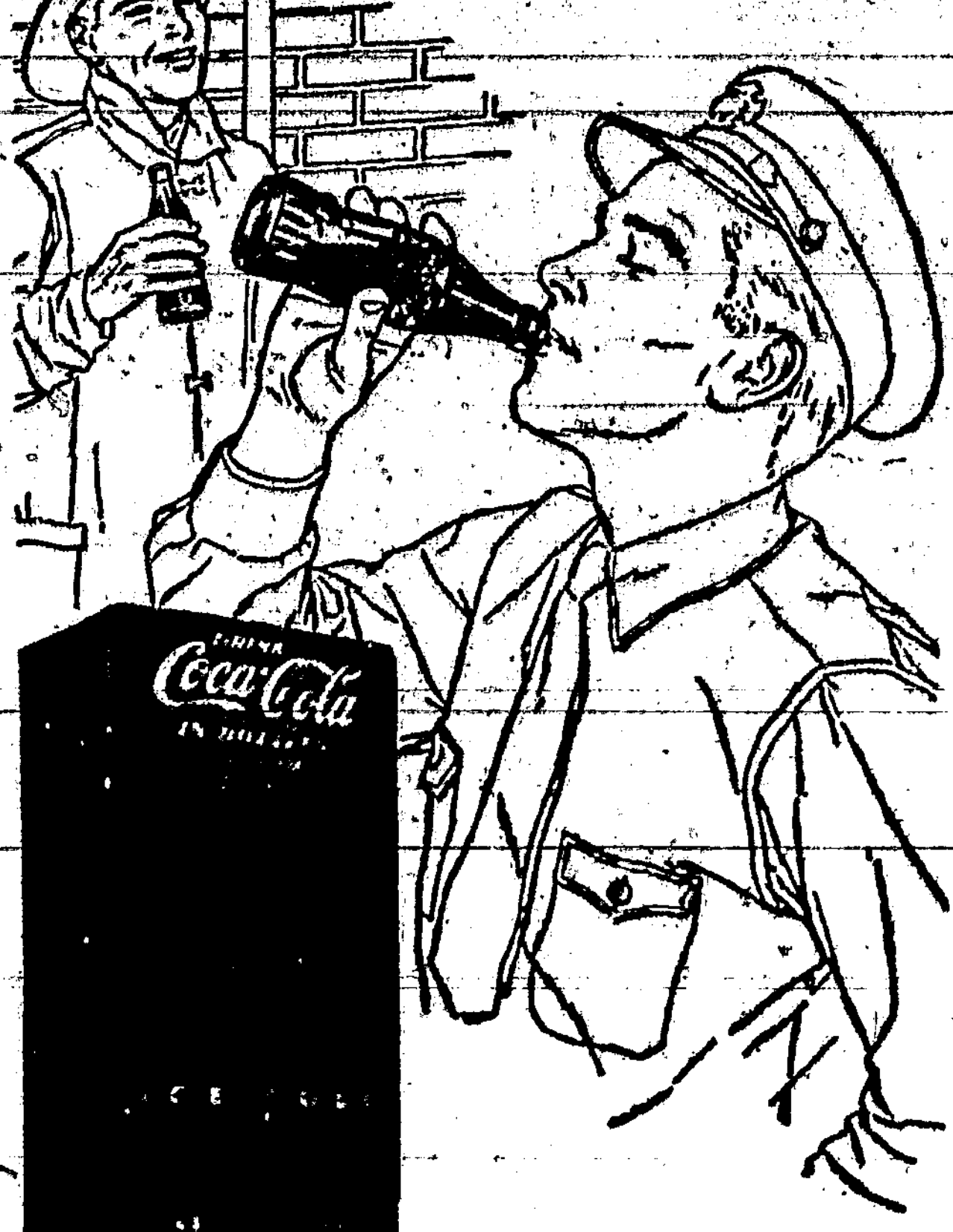
BOTTLED UNDER AUTHORITY OF THE COCA-COLA COMPANY BY The Coca-Cola Bottling Company of Alamogordo

After hard work, you feel the need to pause and rest a bit. When you do, make it the pause that refreshes with an ice-cold bottle of Coca-Cola.