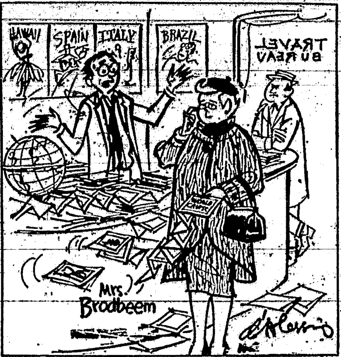
"Well, madam, there's only one remaining country you can go to... and you're IN IT!"