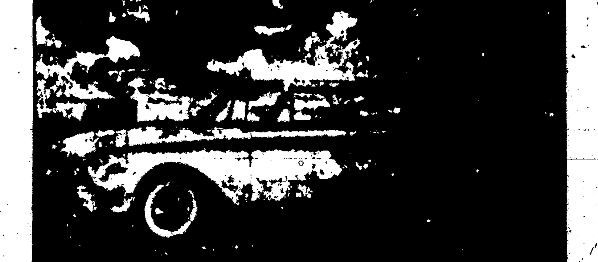
This 1959 Ford Galaxie Town