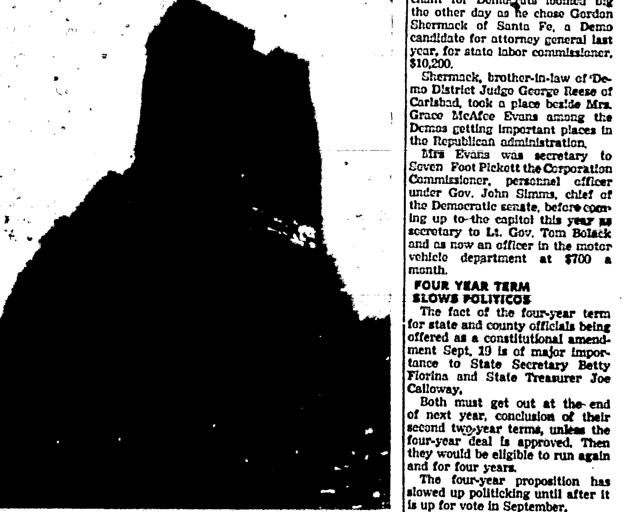
TOWER OF OLD CHURCH AT ABO STATE MONUMENT