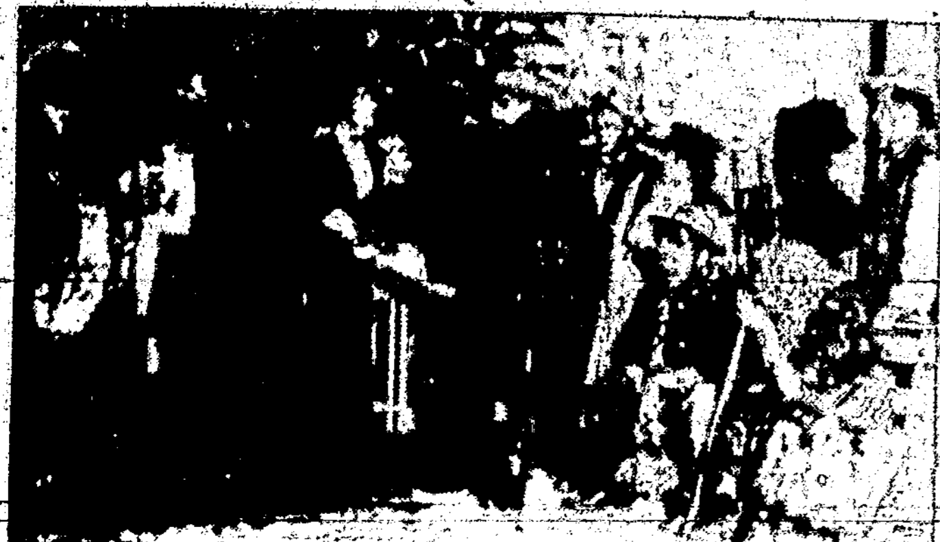
A FIFTY YEAR AGO VIEW - The Amateur Theatrical Club of Carrizozo presented a drama in four acts, 'Because I Love You'.