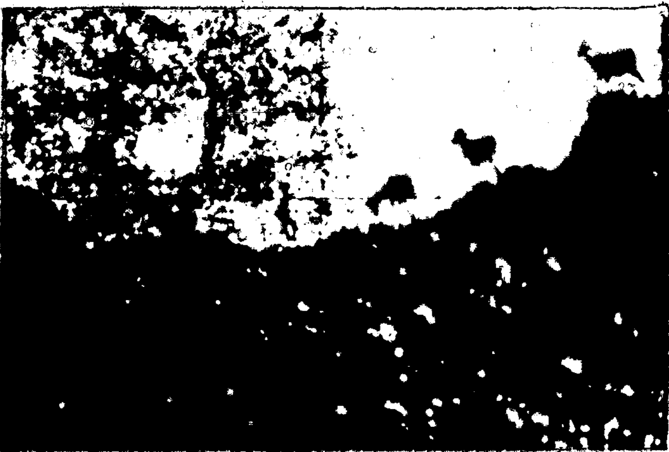
Mexican Bighorns outlined against the sky.

(seen in picture story), is a valuable asset in scaling mountain peaks to evade his enemies. Hoof in the eye of the sheep are so acute that they magnify the ability to see eight times the power of human vision, said Lt. Col. King. The ability of the sheep to see so well and climb so adeptly makes him a sight seldom seen by hunters. Because of this, there is disagreement even among the experts as to the number of sheep in existence. The restricting of the Wildlife Refuge and regulated hunting make San Andres one of the better wild life areas according to Lt. Col. King.